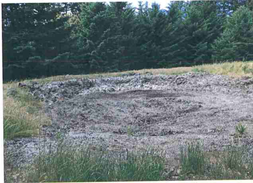
Soil containment area located below Green House #4. Jut Netting, straw wattles and silt fencing to prevent sediment delivery.