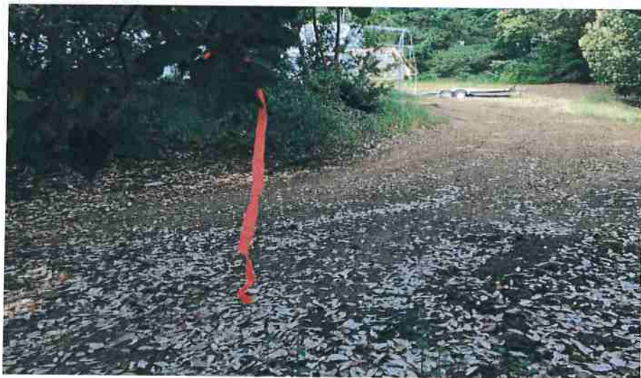
Install rolling dip to slow down water and assure natural flow. All roads need to be processed after winter rains.