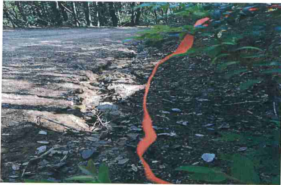
Clean out inboard ditches so water can flow freely to natural outlet.