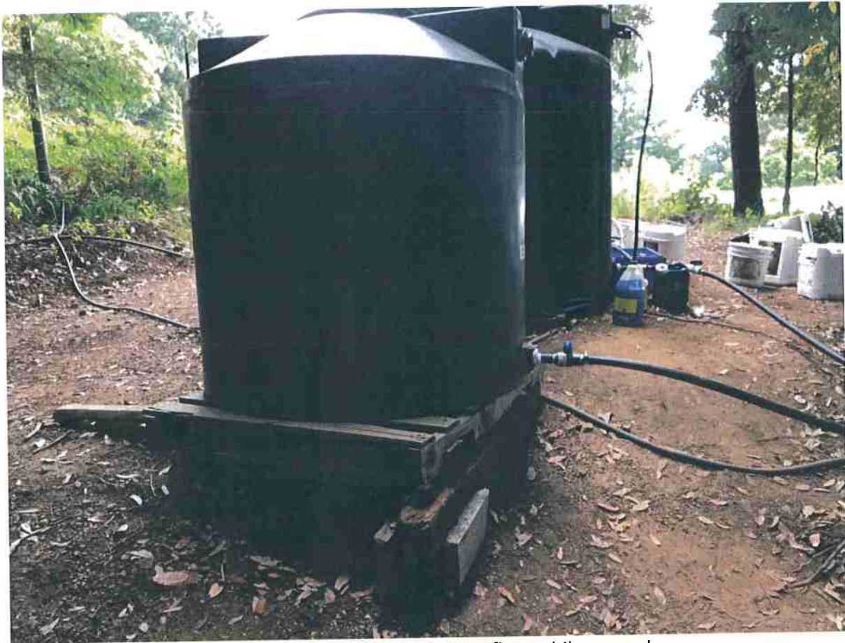
Water tanks need to be place on flat stable ground. Completion date will be 06/30/2017

Pictures: * indicates that corrective measures have been addressed.