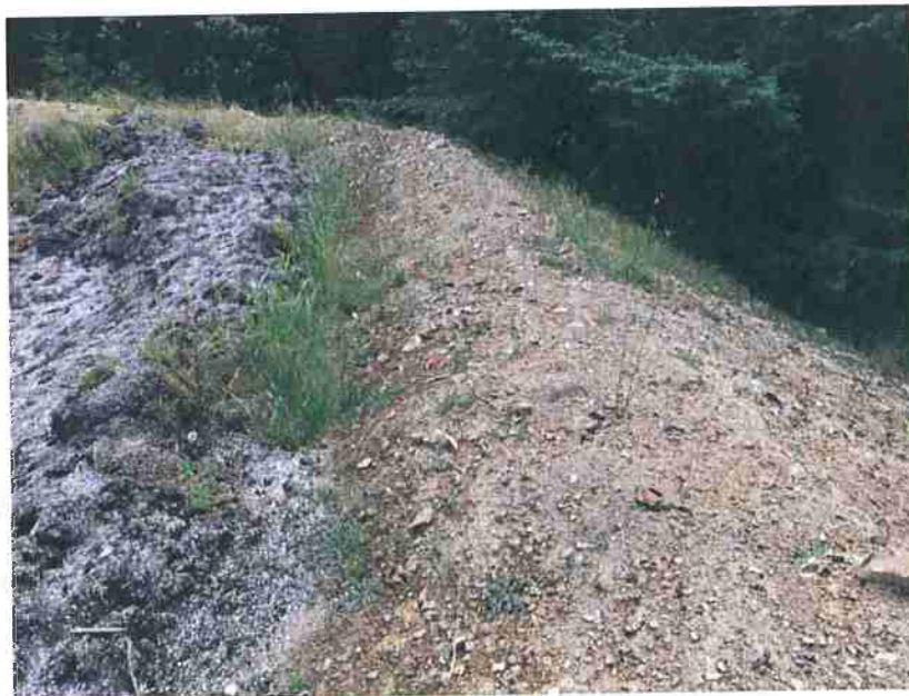
Soil waste will be covered during winter months to prevent runoff.