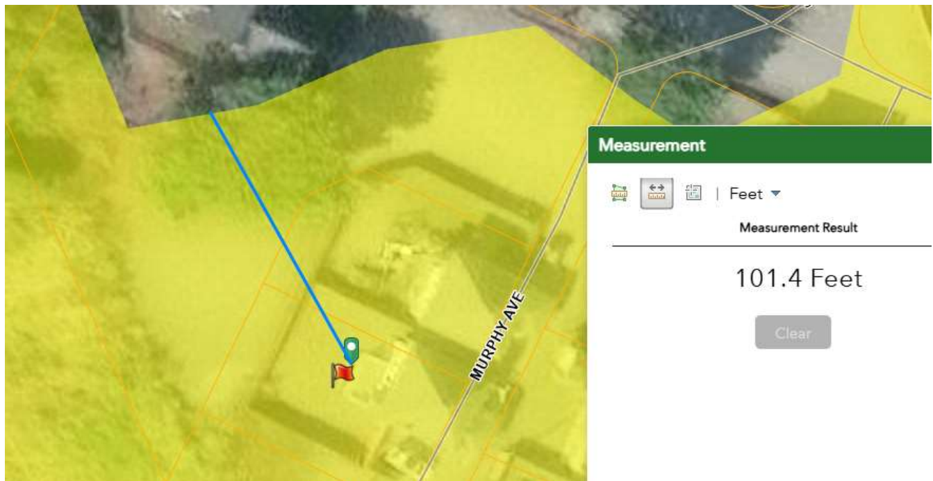
Figure 2: Mapped Tsunami Hazard Area and evacuation area.