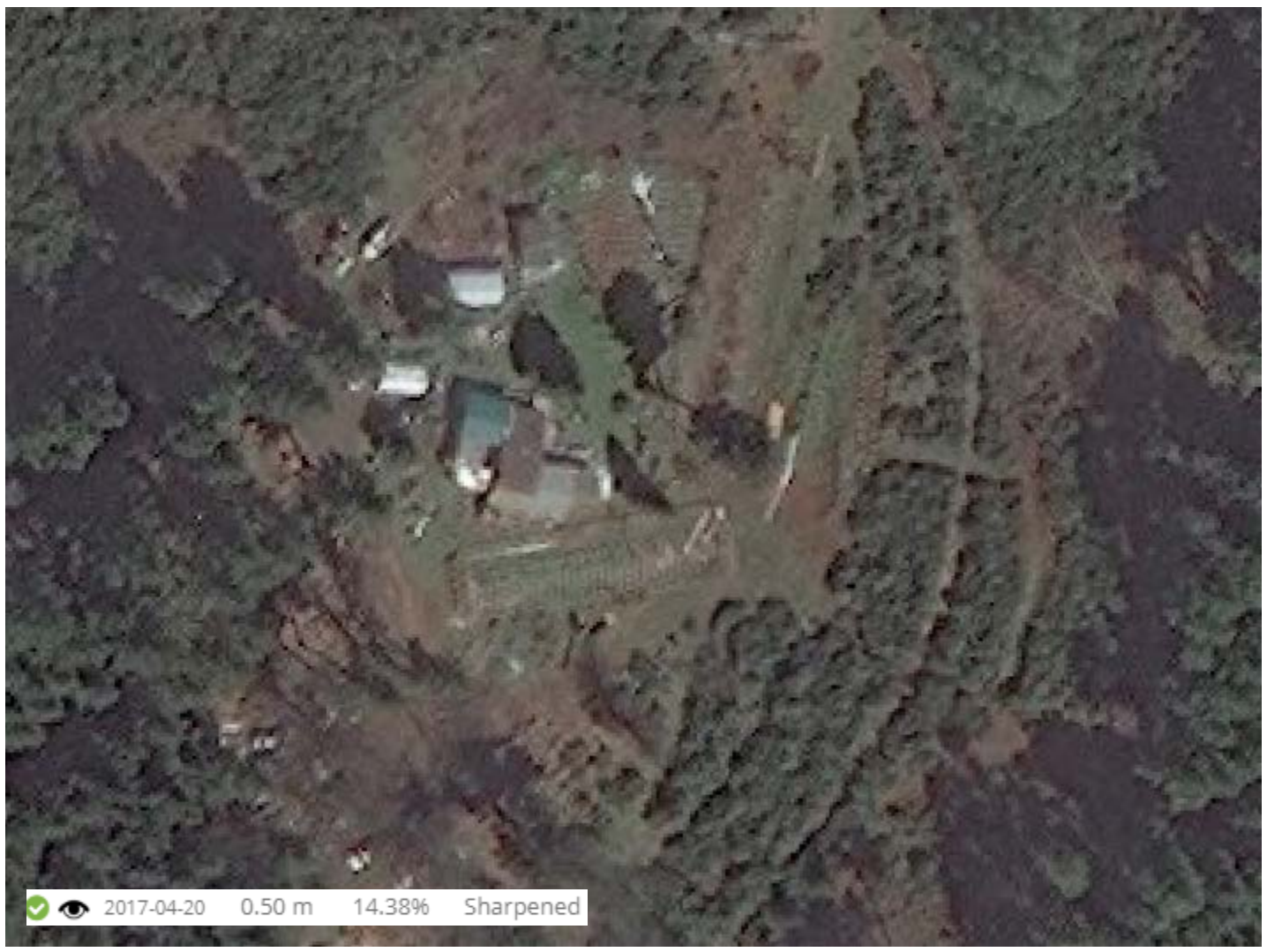
April 20, 2017