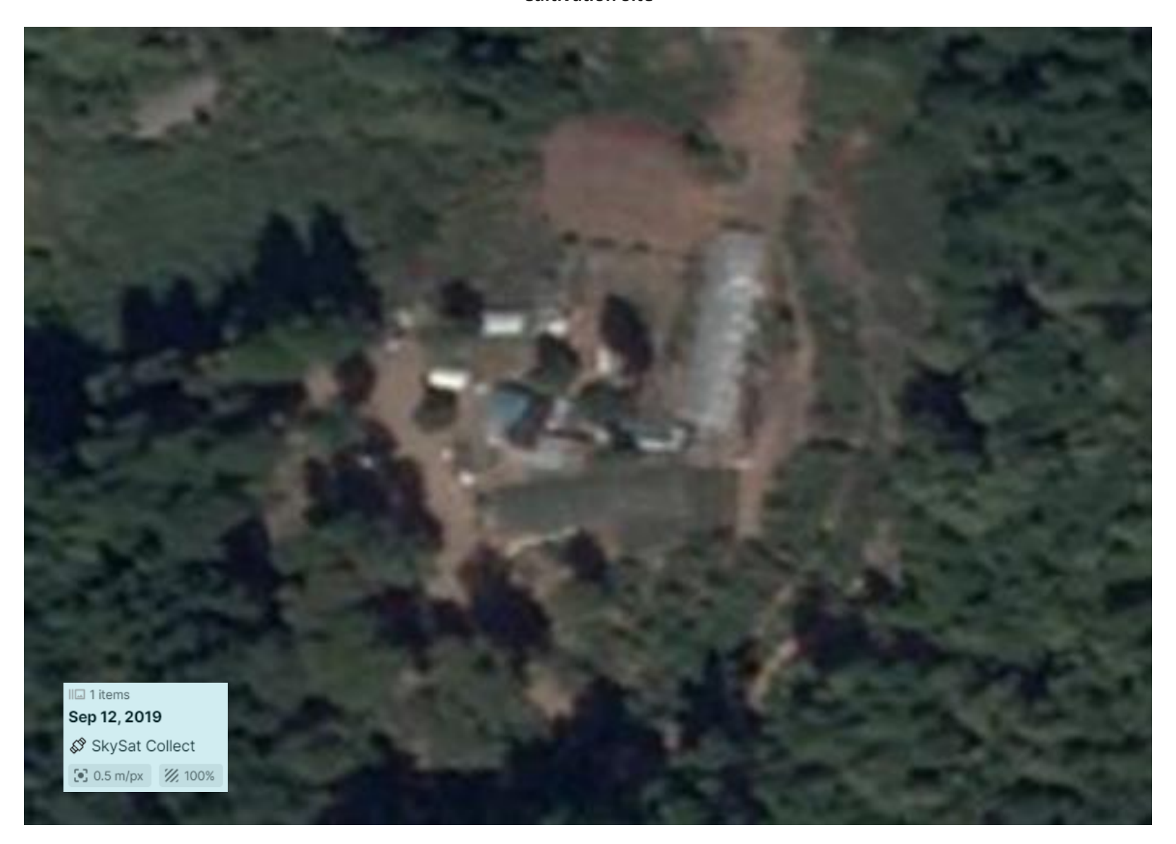
September 12, 2019