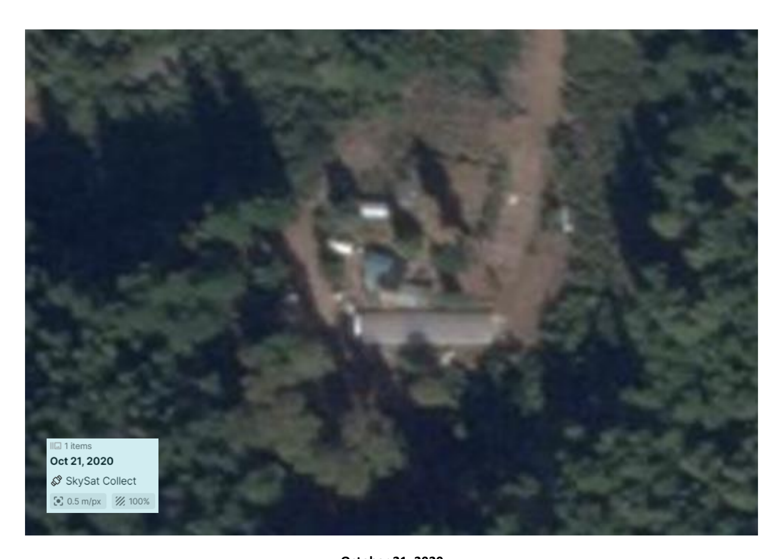
October 21, 2020