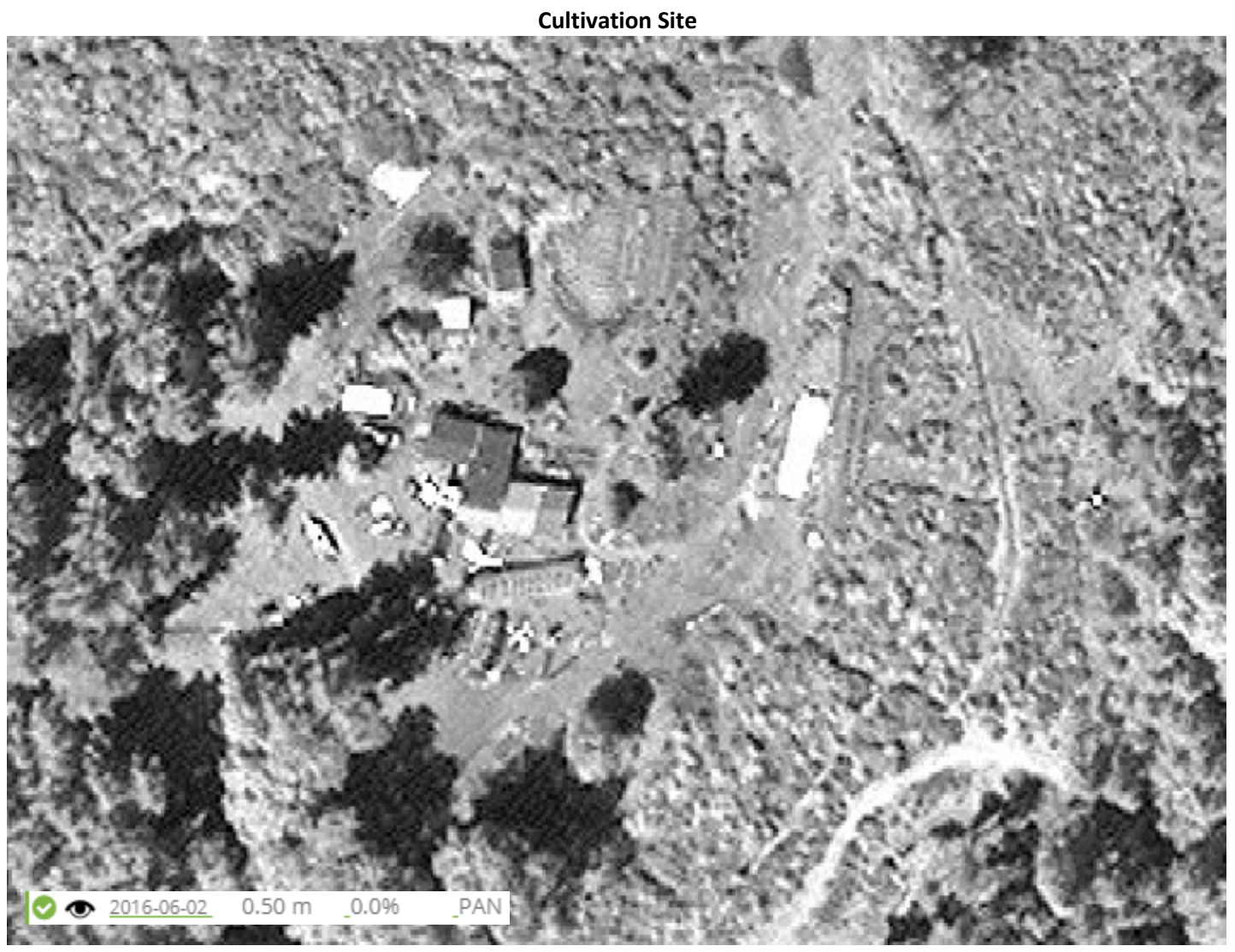
June 02, 2016