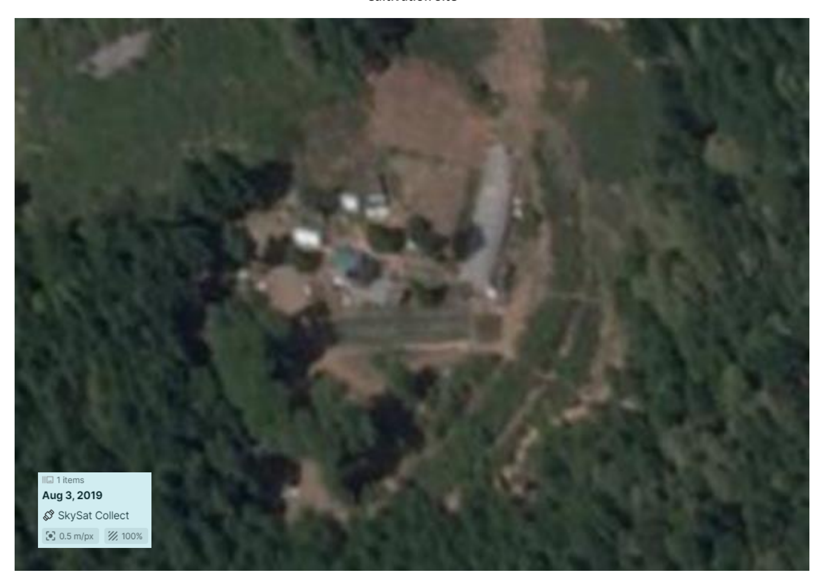
August 3, 2019