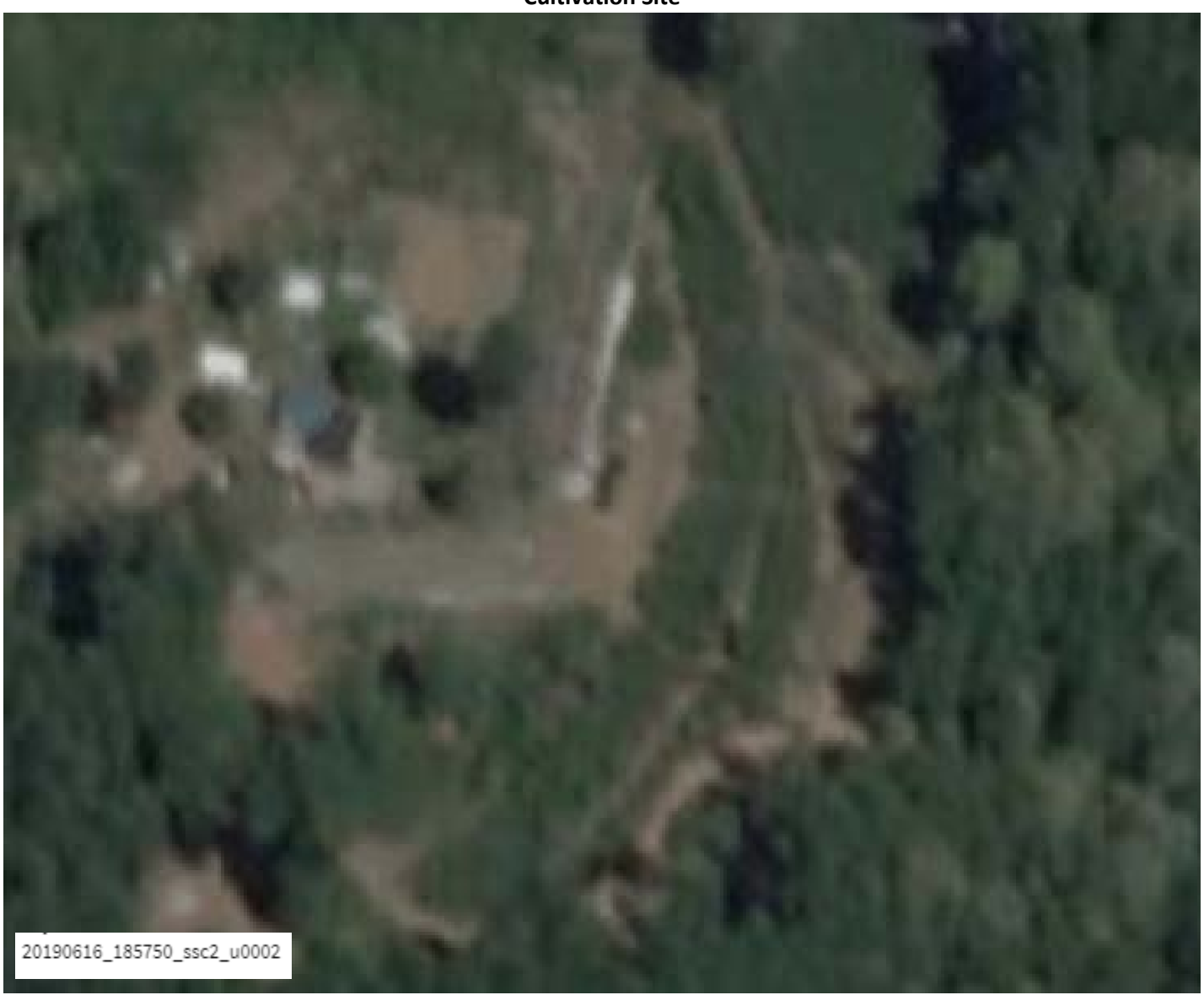
June 16, 2019