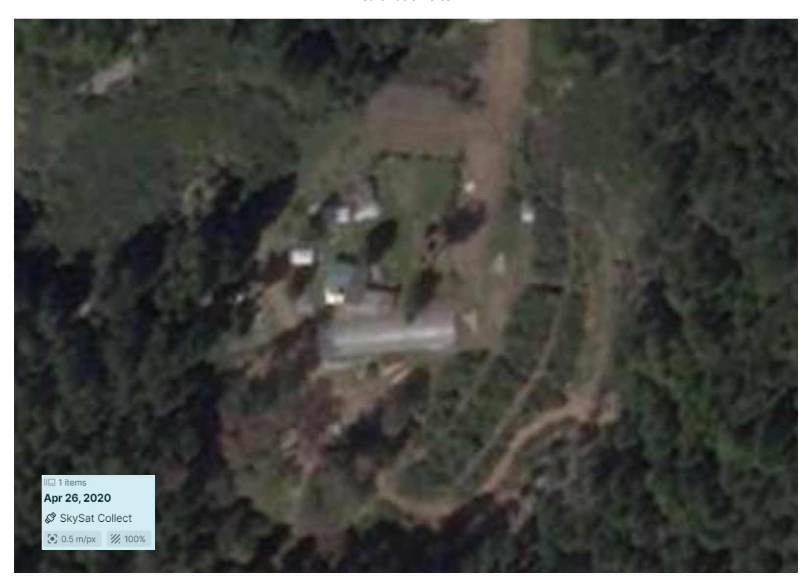
April 26, 2020