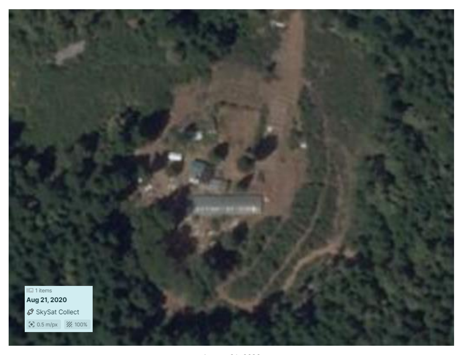
August 21, 2020