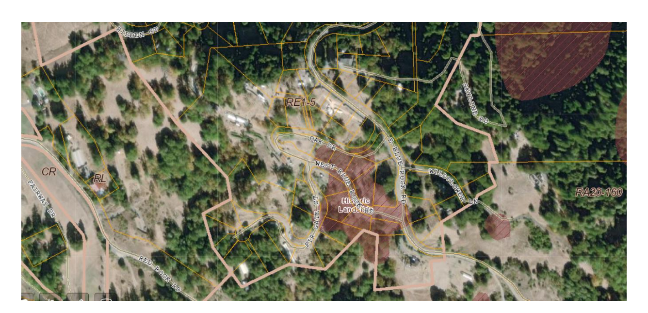
FIGURE 3 - HISTORIC LANDSLIDES AND LAND USE DESIGNATIONS

Project Area contains historic landslide feature