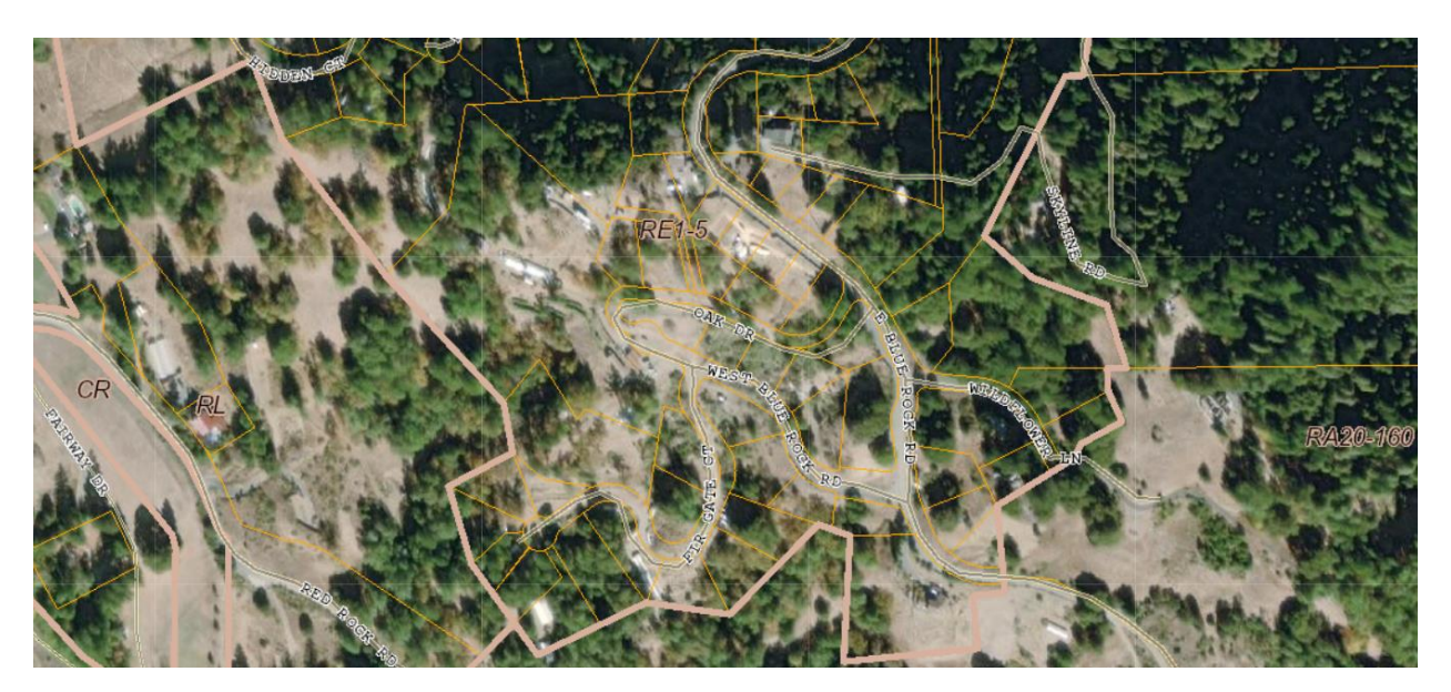
FIGURE 4 - 2019 RHNA HOUSING INVENTORY AND LAND USE DESIGNATIONS