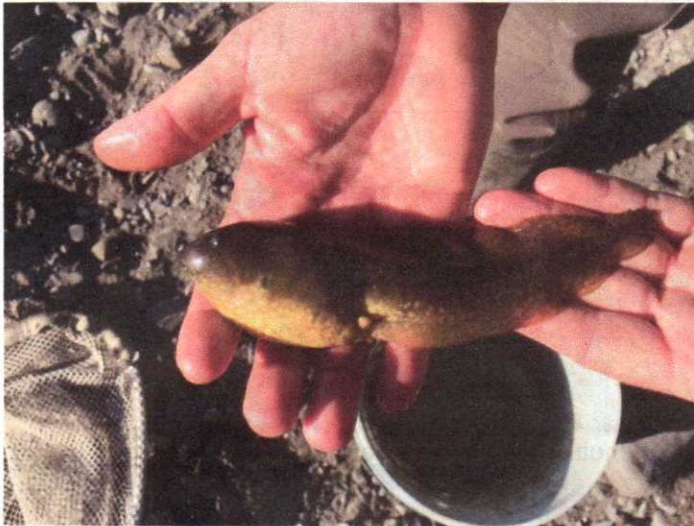
This is a photo of a Bullfrog tadpole.