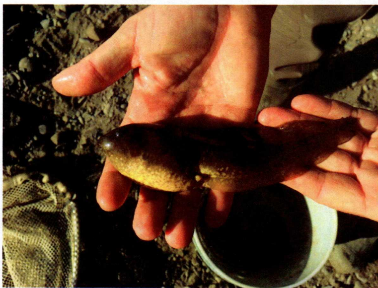
This is a photo of a Bullfrog tadpole.