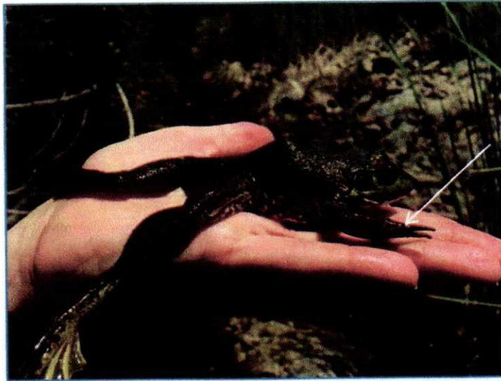
The photos shown in this Appendix demonstrate a medium sized adult bullfrog that was removed from Ten Mile Creek, Mendocino County. Note the bullfrog has a large tympanum, (circular ear drum shown with an arrow) and does not have distinct ridges along its back (dorsolateral folds).