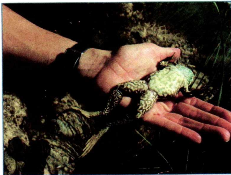
The bullfrog has somewhat distinct mottling and the underside of the bullfrogs hind legs are not shaded pink or red.