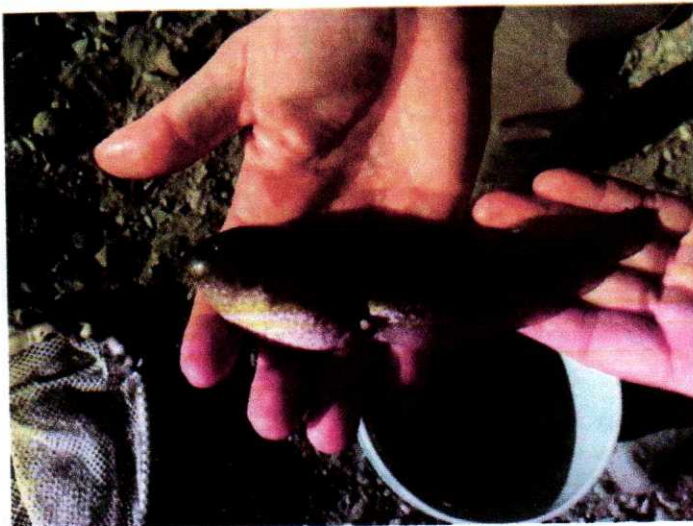
This is a photo of a Bullfrog tadpole.