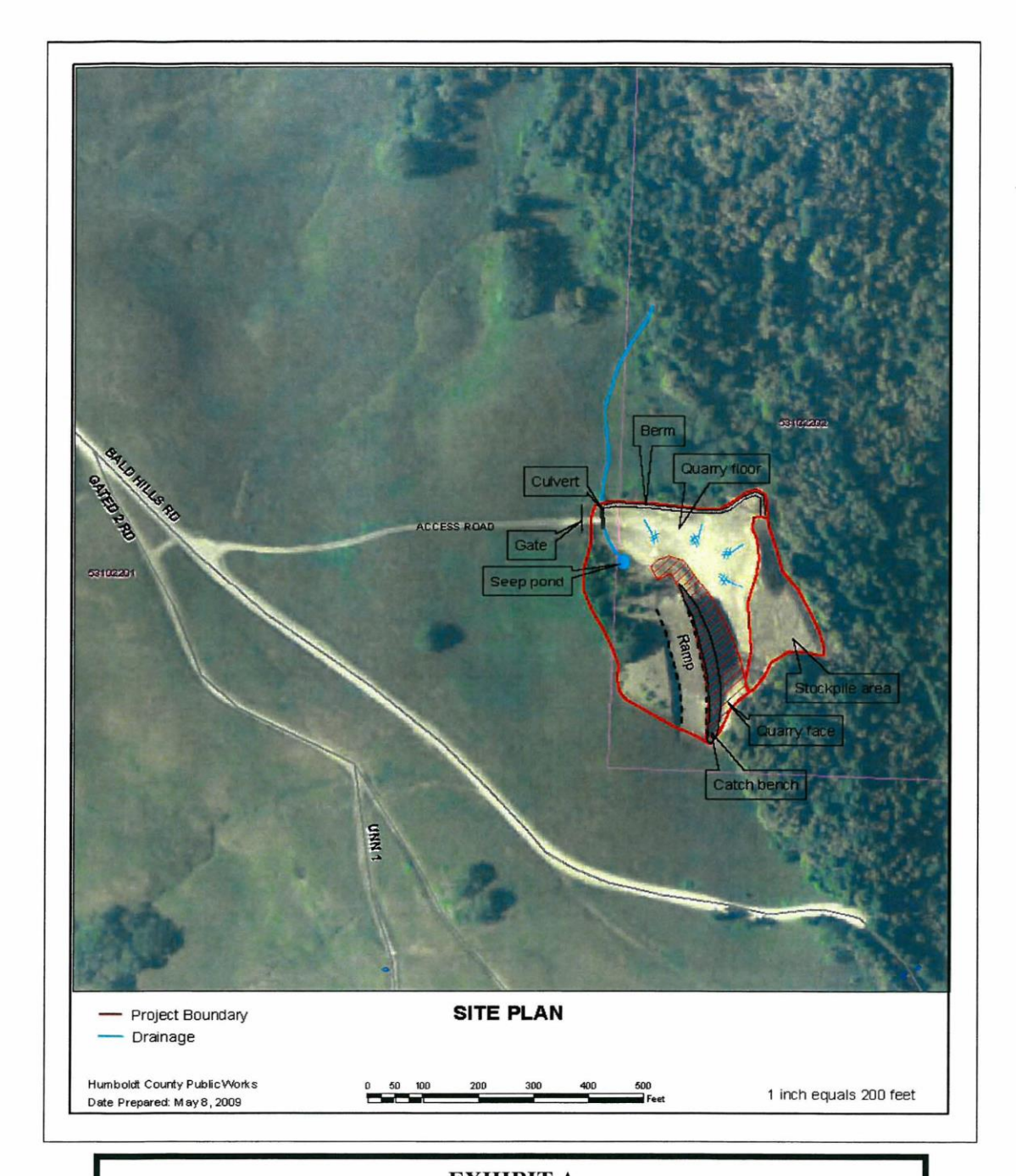
EXHIBIT A BALD HILLS – COYOTE PEAK BORROW AND STOCKPILE SITE