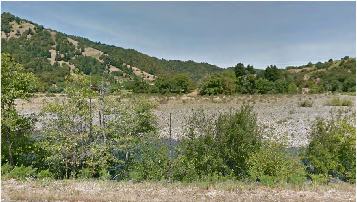
Image 1. View of Project Site Looking North from Wilder Ridge Road Across the Mattole River