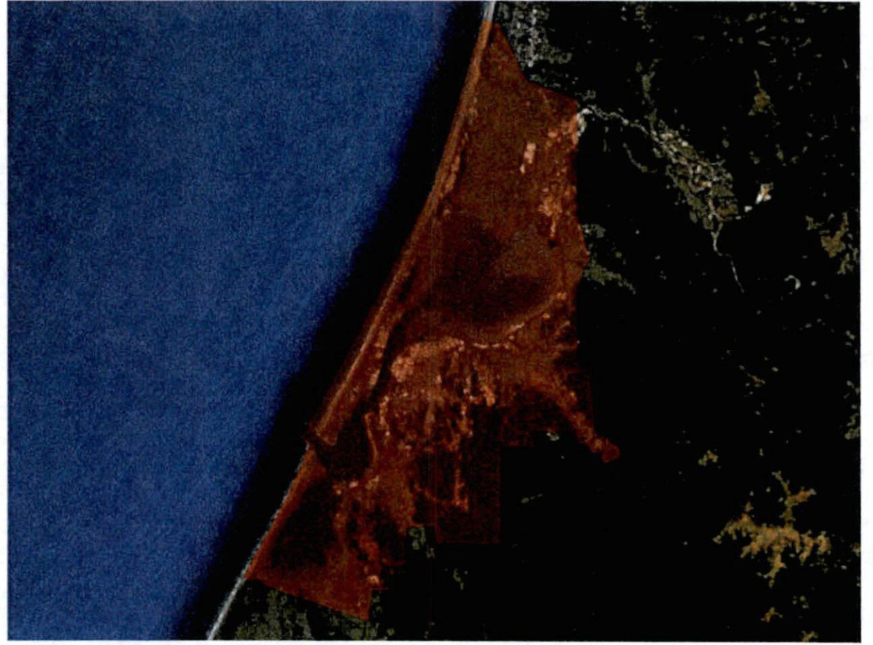
PROPOSED FLIGHT AREA: EUREKA, CALIFORNIA 2018 (~100 SQ MI)

<u>FINANCIAL IMPACT</u>: There is no impact to the General Fund. Overall this will increase the Planning and Building Department Advance Planning Division's budget by $53,415 (budget unit 282). The General Plan User Fee Trust Fund (3698) has sufficient funds to cover these expenses.