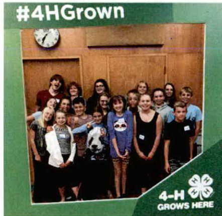
4-H Positive Youth Development