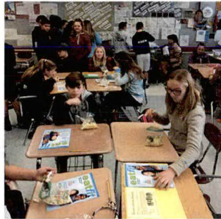
Expanded Food and Nutrition Education Program