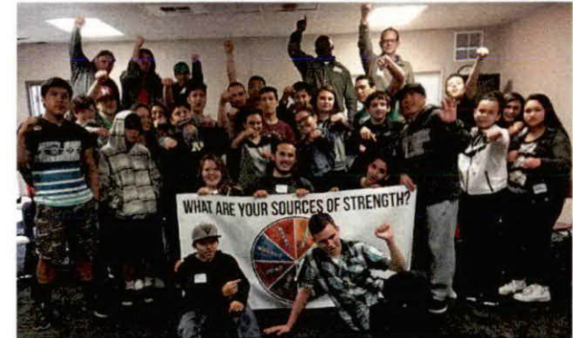
Federally Recognized Tribal Extension Program