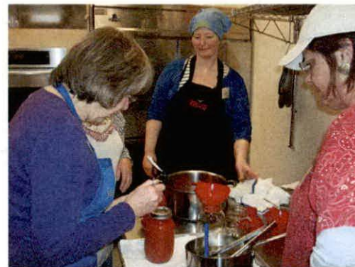
Master Food Preserver