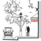
Under Canopy Signs