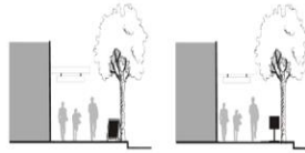
A-frame & Standing Signs