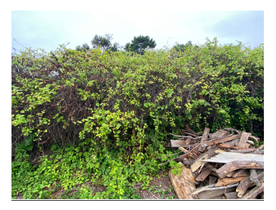
Figure 8. Japanese honeysuckle along the western section of the northern fence line/parcel edge.