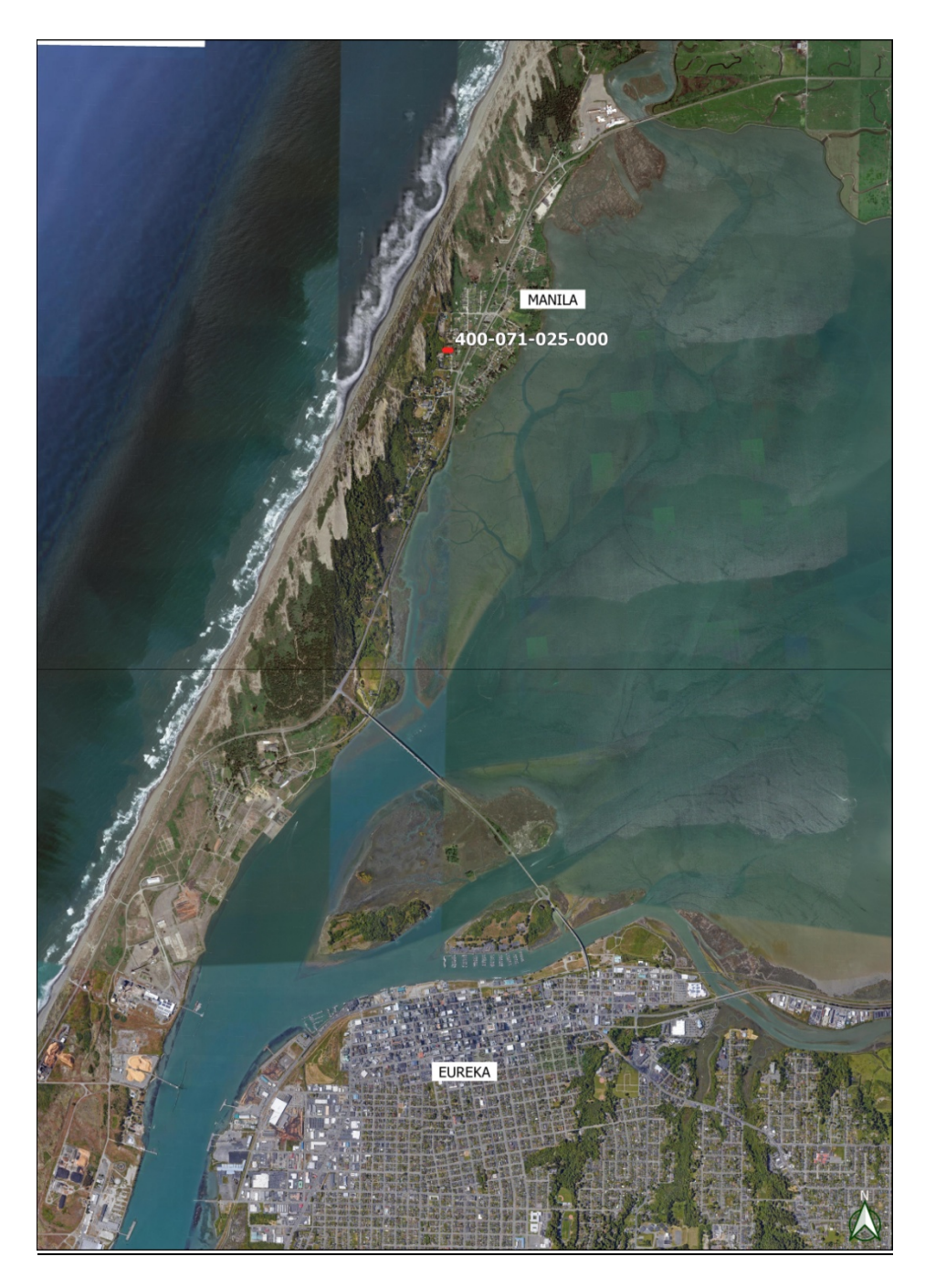
Figure 1. Vicinity Map of Project Parcel