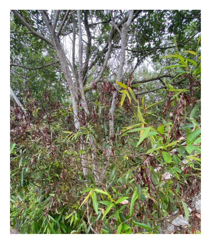
Figure 4. Pacific Willow and PSSIC Mapped NWI Wetland within Western Project Parcel Boundary

The proposed project will not impact the adjacent wetland in any way. No earthwork is proposed, and no tree removal would occur as a result of the proposed project. Project related vegetation impacts are limited to trimming a limited area of invasive vegetation (Himalayan blackberry and fuchsia) from contacting the house itself in order to provide for access for people and tools needed to rehabilitate the structure and construct the 2<sup>nd</sup> story addition; however, this proposed minor vegetation trimming would be consistent with normal impacts associated with past and future home occupancy and maintenance and would not include impacts to any native wetland species. In addition, the existing house is, and would continue to be, connected to community water and sewer through the Manila Community Services District. Therefore, there would be no changes to hydrology and no hydrological impacts, temporary or otherwise, would occur as a result of project construction.