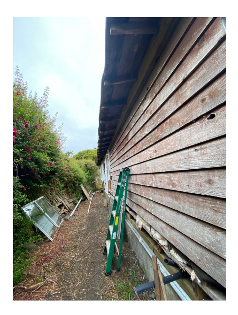
Figure 6. Non-native fuchsia hedge along the northeastern parcel boundary adjacent to existing structure