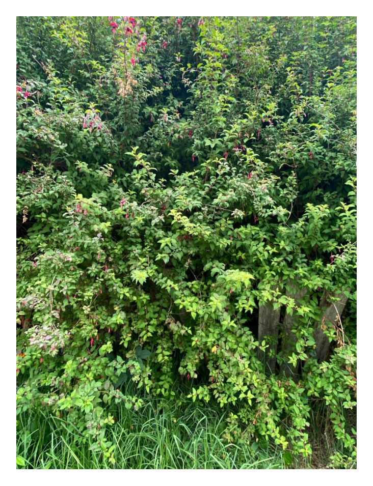
Figure 7. Fuchsia on northern fence line at the central project parcel boundary.