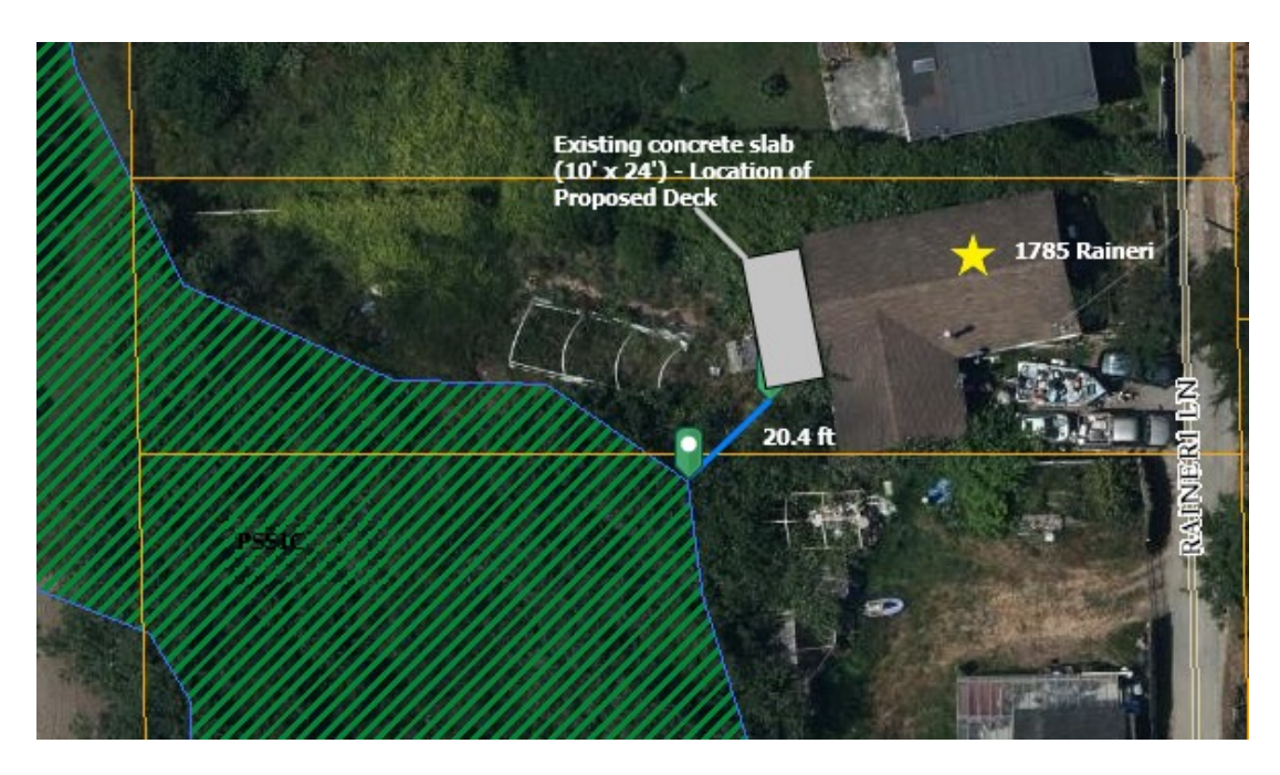
Figure 5. Location of Existing 240 sqft Concrete Slab