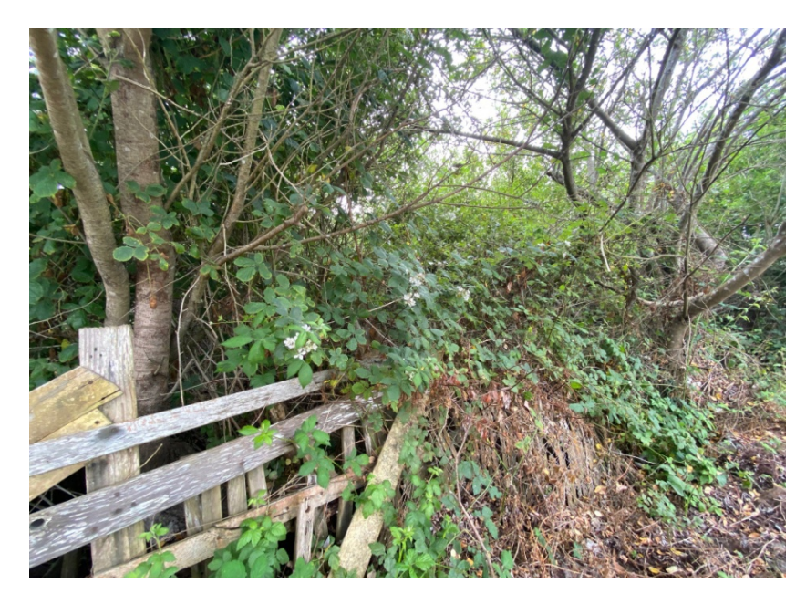
Figure 3. Coast Willow Growing along the Southern Parcel Boundary; Himalayan blackberry shown growing with California Blackberry in the Understory and over existing fence.

On both parcel lines, the NWI delineation is accurate in delineating the upland boundary of the hydrophytic vegetation, and therefore, the limits of the 1-parameter buffer wetlands. The clear change in topography combined with a dense occurrence of willow as well as previous observations of hydrology within the lower elevation basin on the parcel south and west of the Project - also indicates that the 3-parameter wetland and the animal and plant species found within, occur outside of the project parcel limits.