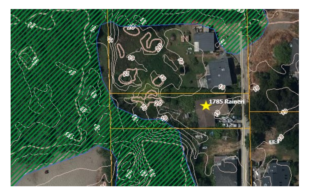
Figure 2. Project Site Topography

The house is located on the North Peninsula, approximately 0.30 mile inland (east) of the Pacific Ocean and 0.27 mile west of Humboldt Bay. The parcel is in the middle of a residential development and surrounded by existing homes on all sides except the west where the wetland connects to the larger wetland toe the southwest creek is located. To the north and south of the Project site there are many more residences, highway 255 bisects the community to the east, and there is a clearing for a horse pasture, forested wetlands, and the dunes and ocean to the west of the parcel (Figure 2). The project parcel has a high elevation of 19 feet with low slopes, 0-2%; the elevation decreases from east to west with a low elevation of 17 feet at the western project boundary (Figure 2).