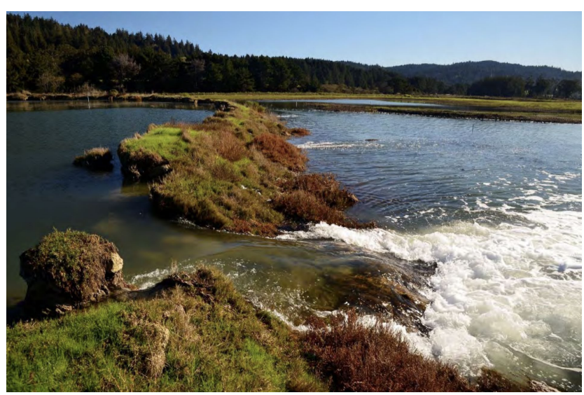
Dike overtopped during a King Tide inundating lands on South Bay<sup>4</sup>

When breached, the 25.7 miles of highly vulnerable shoreline structures will expand the tidal inundation footprint of Humboldt Bay by 52% or nearly 9,000 acres. Breaching of dikes has already begun partially due to lack of, or deferred, maintenance. King Tides have also been a contributor. In addition to the dikes, there are 62 tide gates whose effectiveness can be compromised by rising sea levels. Areas impacted the most will include the Eureka Slough (7.13 miles), South Bay (5.1 miles), Mad River Slough (4.4 miles) and Arcata Bay and its railroad shoreline (4.0 miles).