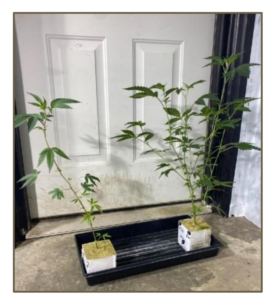
Overcrowding = Lost Time

The first plant will require an additional three weeks of vegetation time, including water, lighting, and nutrients before being moved to the canopy area.