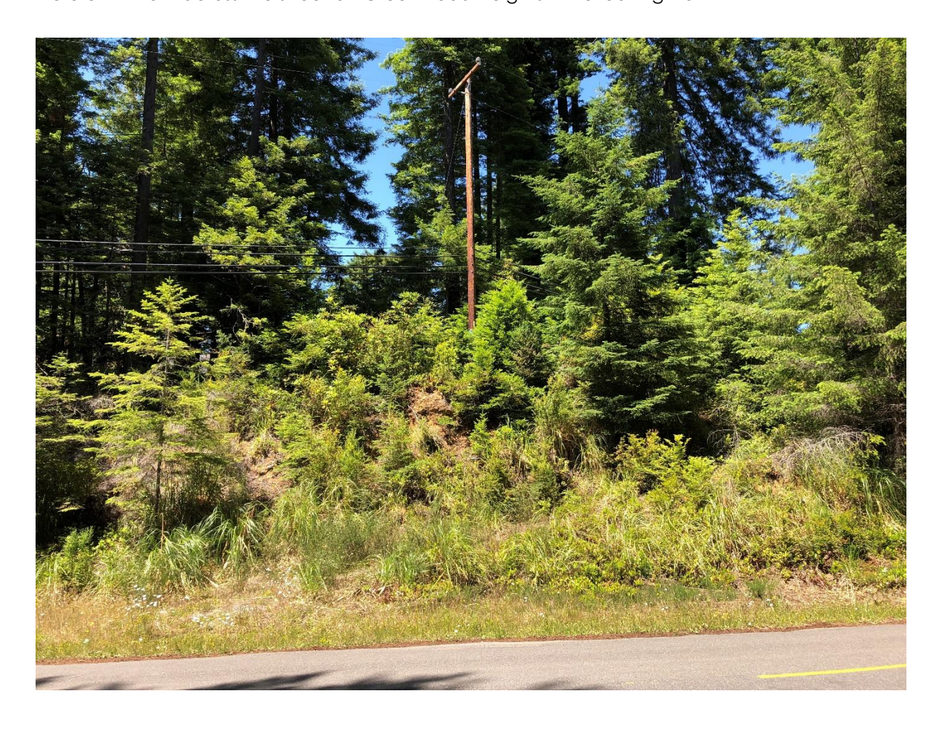
Picture 1 – From across the street on Greenwood Heights Drive looking North