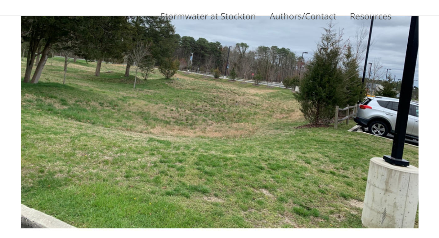
Figure 4: Stockton University's detention basin, located by the Arts and Science Building. Helps to prevent flooding from Lake Fred and runoff water from nearby parking lots. (Vincent Morano, 2020)