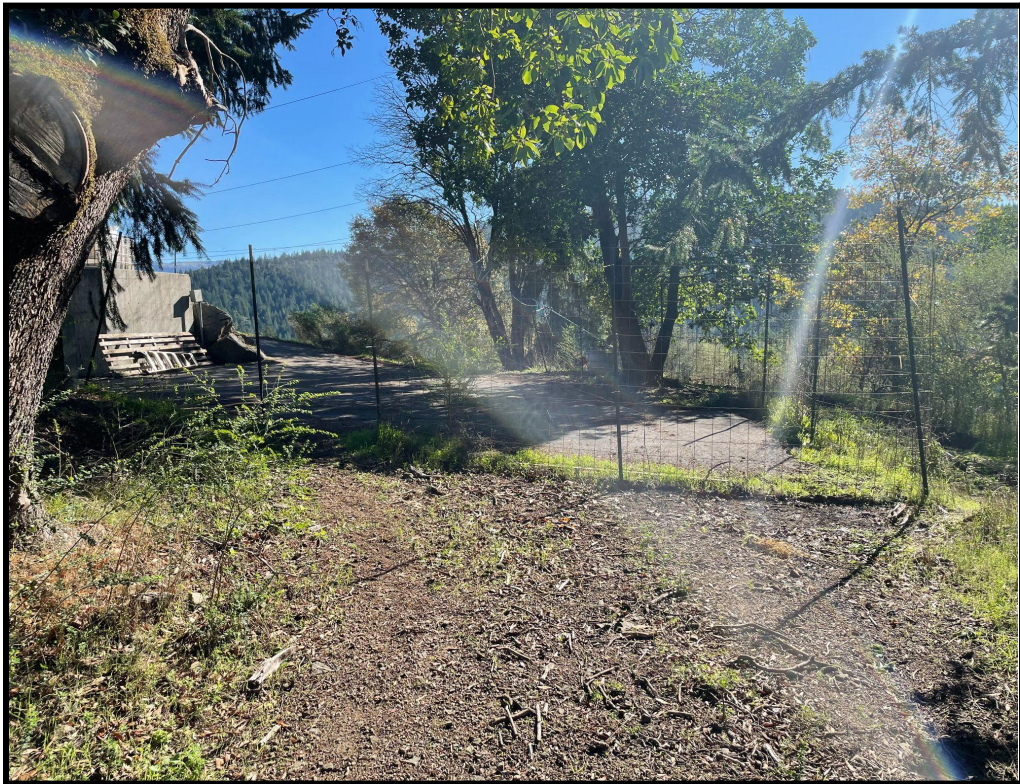
Post cleanup image of the area.