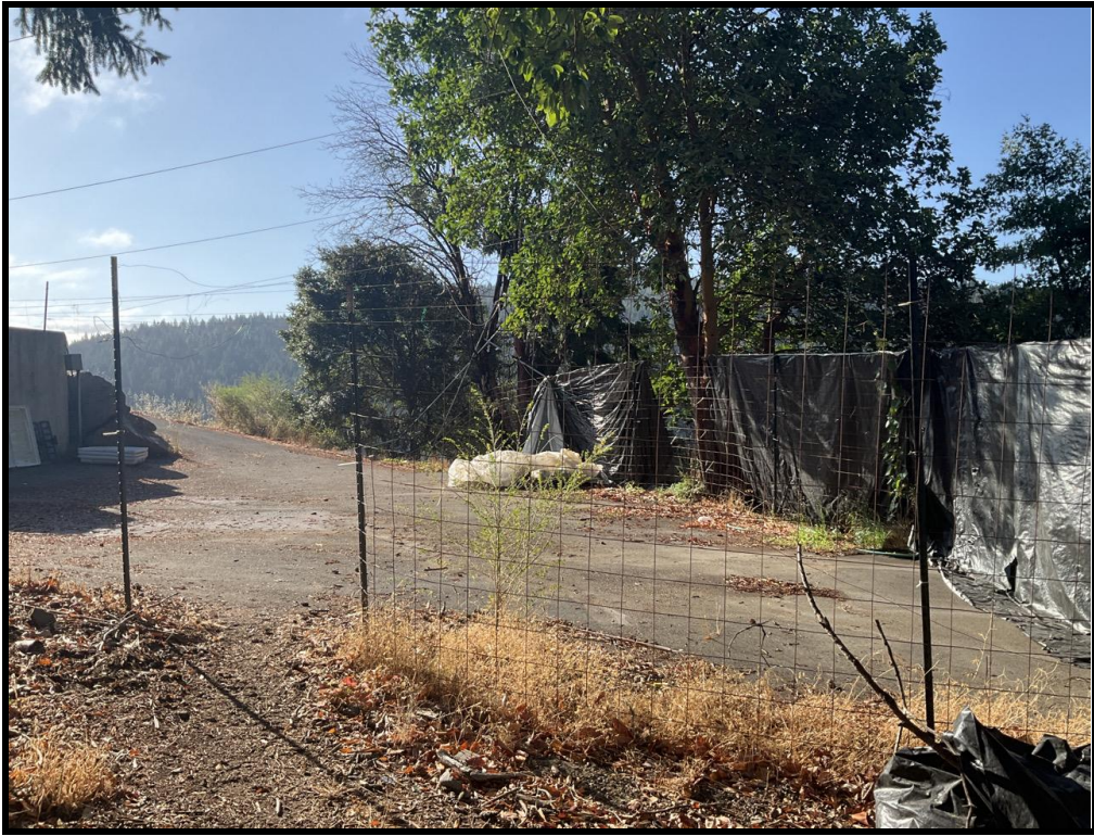
Photo taken by CDFW requesting cleanup of the area.