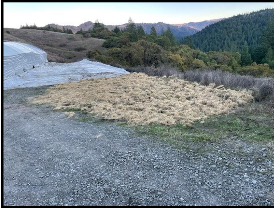
Invasive plants, discarded soil, and debris have been removed and covered with straw for erosion control.