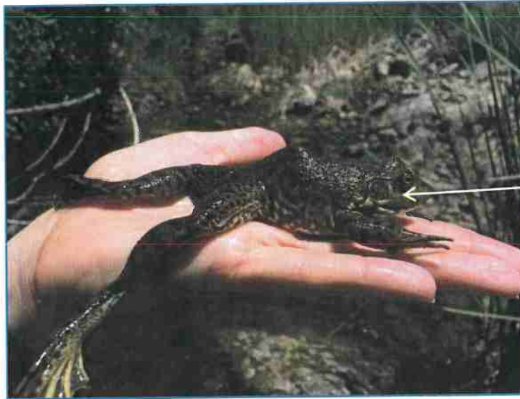
The photos shown in this Appendix demonstrate a medium sized adult bullfrog that was removed from Ten Mile Creek, Mendocino County. Note the bullfrog has a large tympanum, (circular ear drum shown with an arrow) and does not have distinct ridges along its back (dorsolateral folds).