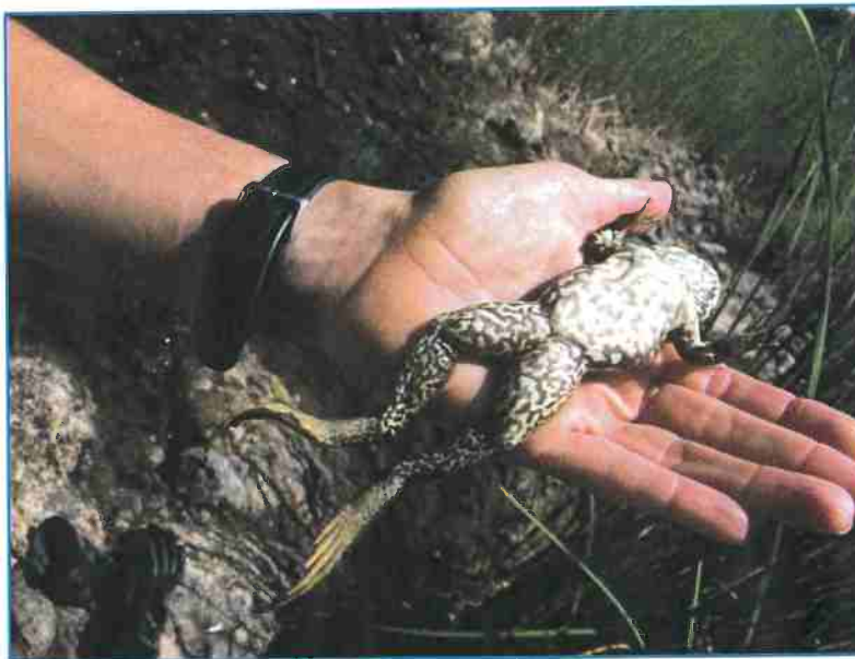
The bullfrog has somewhat distinct mottling and the underside of the bullfrog's hind legs are not shaded pink or red.