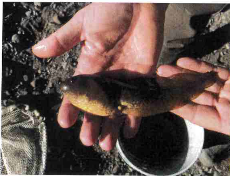
This is a photo of a Bullfrog tadpole. (Photo taken by Mike van Hattem).