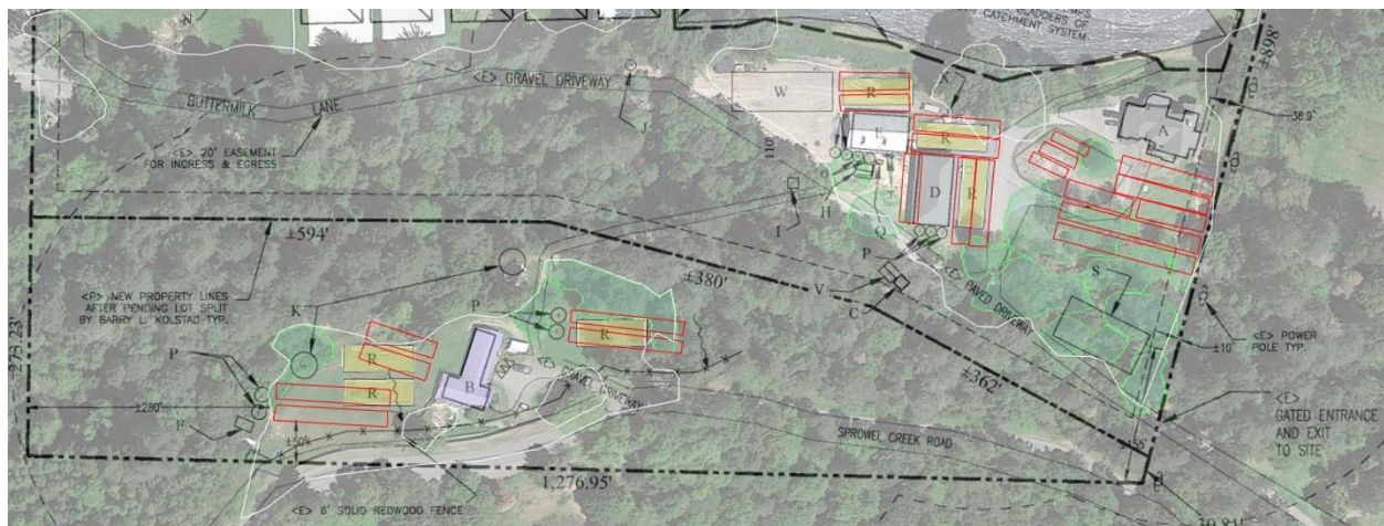
Revised Site Plan Analysis - areas outlined in red are previously proposed greenhouse locations, yellow areas are new greenhouse site locations, green areas identify approximate canopy of locations where tree removal occurred in 2020 and 2021

After performing a comparison and analysis of the proposed project revisions, planning staff have determined that the proposed greenhouses and appurtenant cultivation infrastructure are now proposed in areas of the property that have been non-forested since 2015. For this reason, the project is once again being recommended for approval at this time.