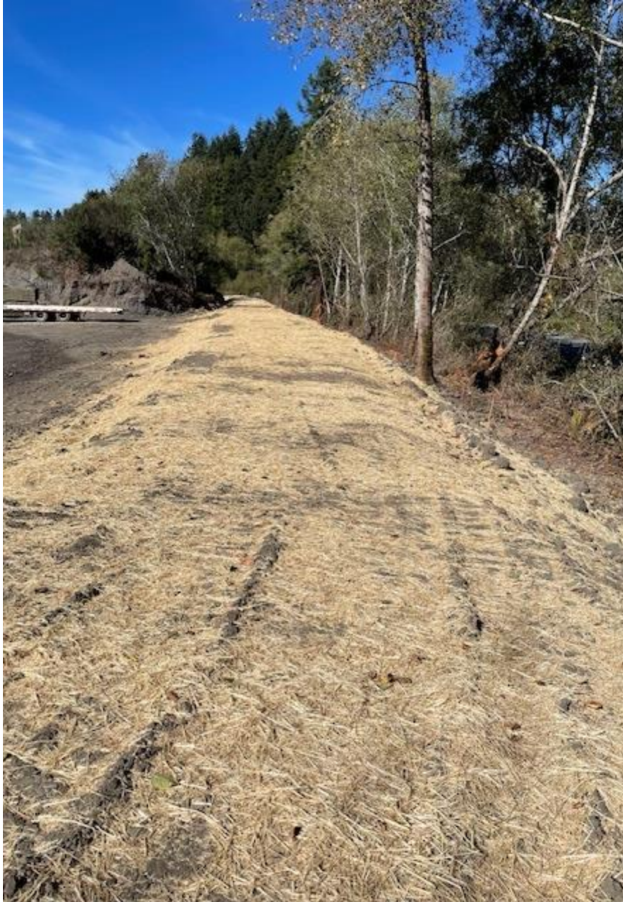
Along Glendale Drive and adjacent to a drainage and possible regulated watercourse.