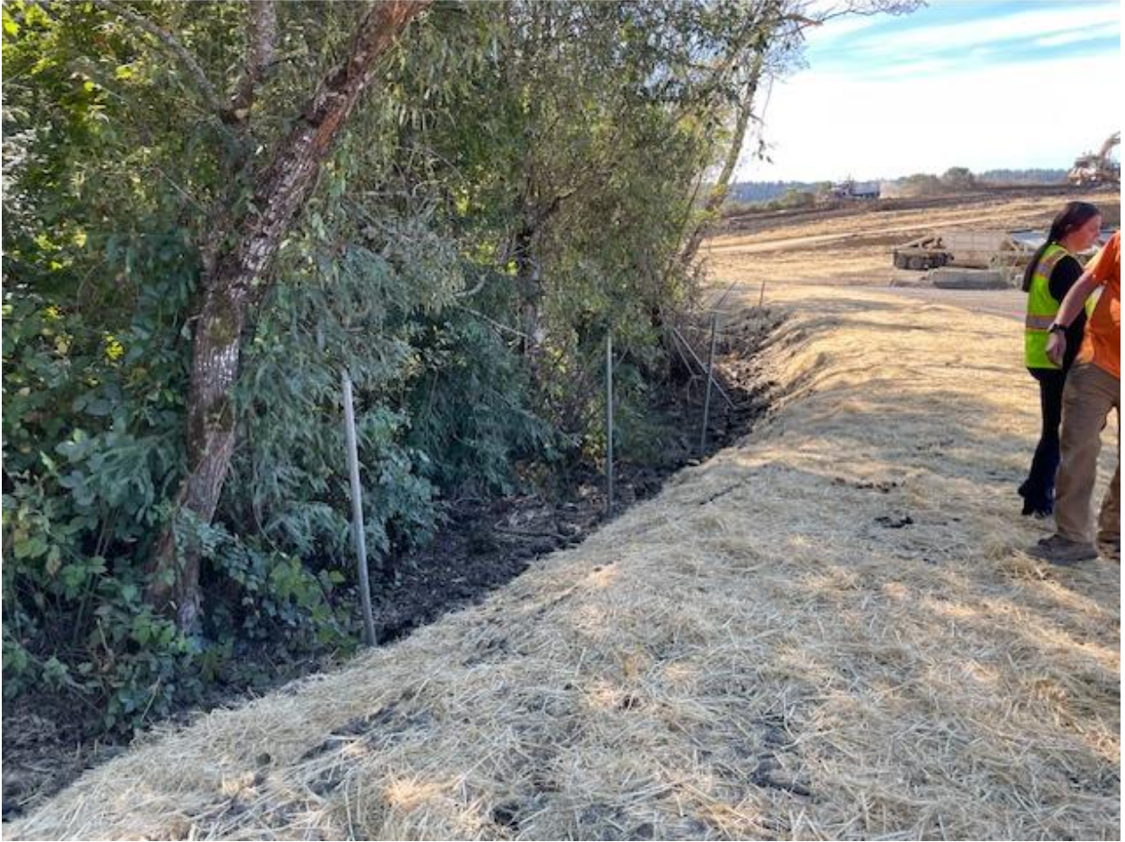
Adjacent to Noisy Creek