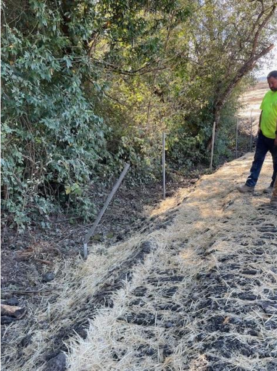
Adjacent to Noisy Creek