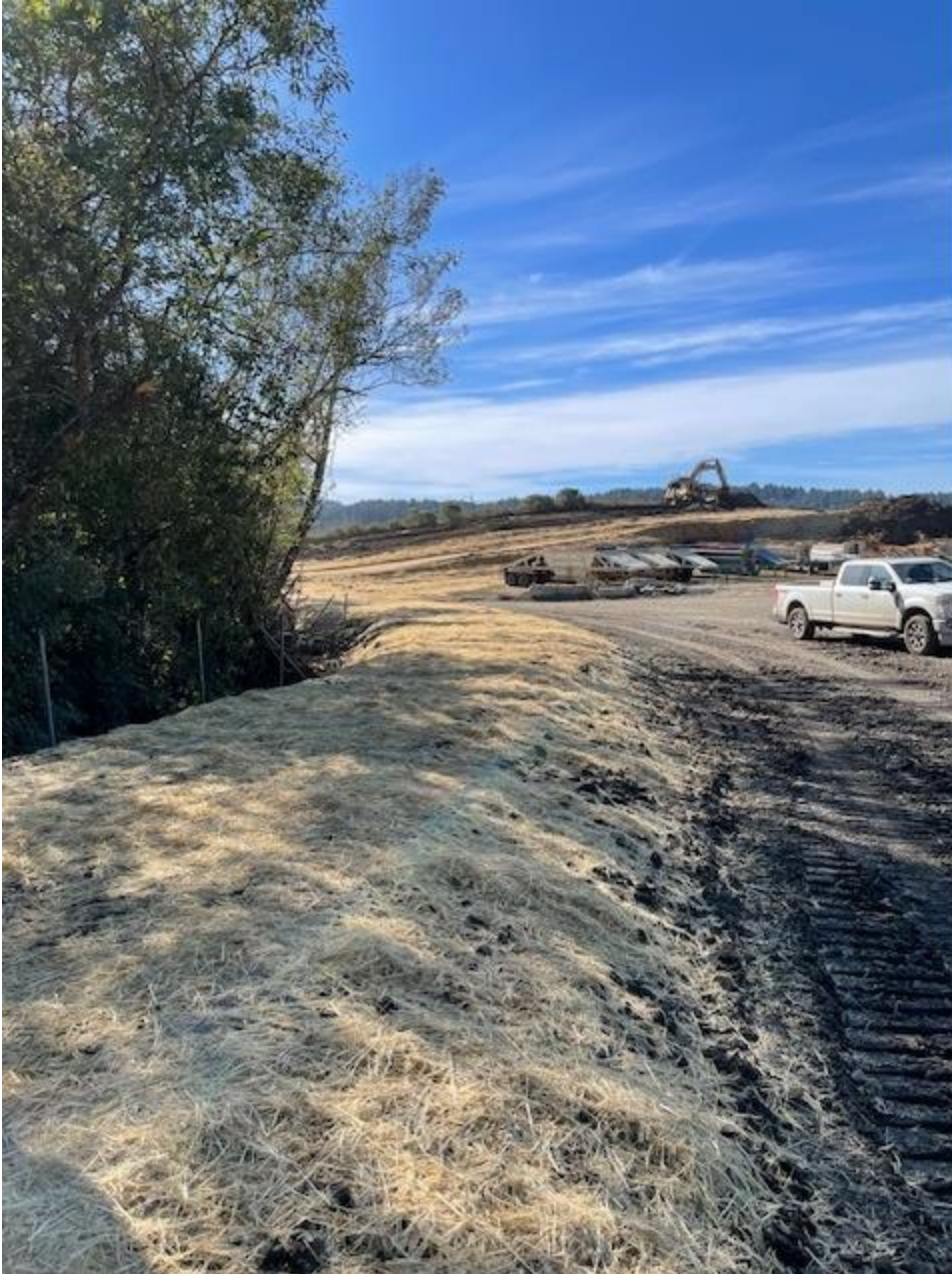
Adjacent to Noise Creek