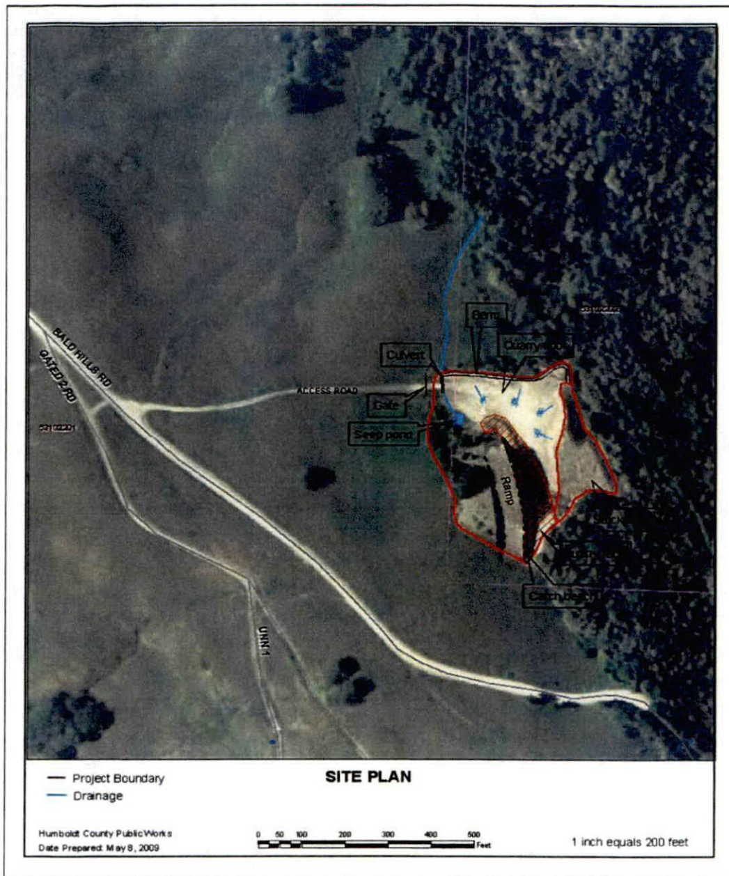
EXHIBIT A BALD HILLS – COYOTE PEAK BORROW AND STOCKPILE SITE