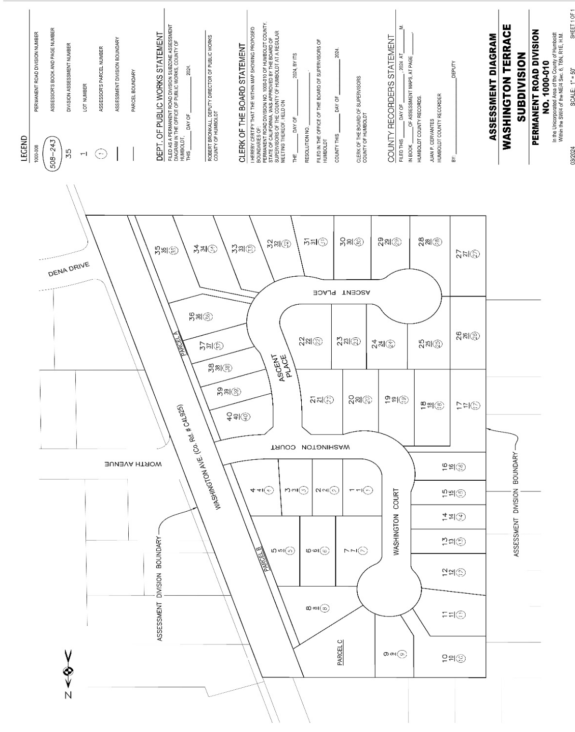
EXHIBIT "B" (Assessment Diagram)