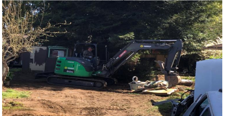
Removing trash under the brushes with excavator.