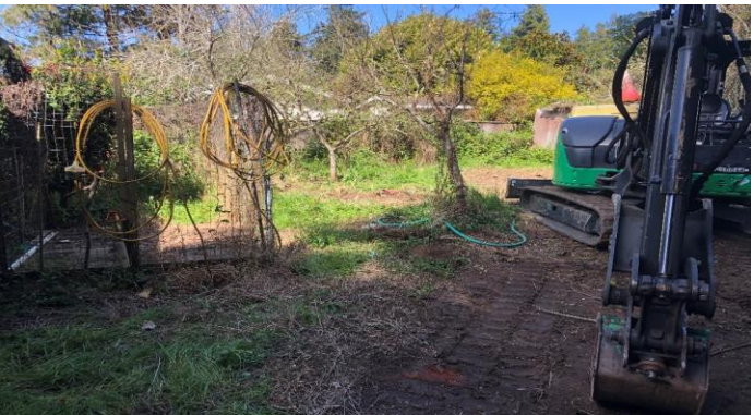
Removing debris from inside wired enclosure with mini