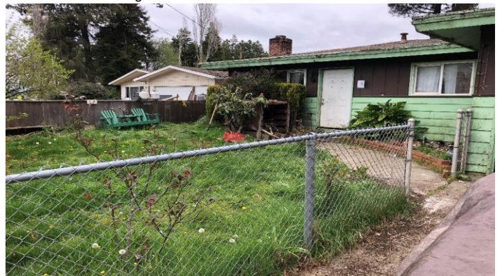
Cleaned up front yard.