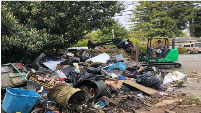
Crashing debris for load out with mini excavator.