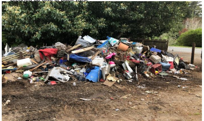
Stock pile trash and debris for load out.