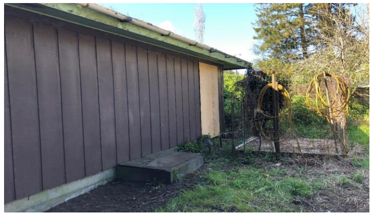
Boarded window at the back of the house.