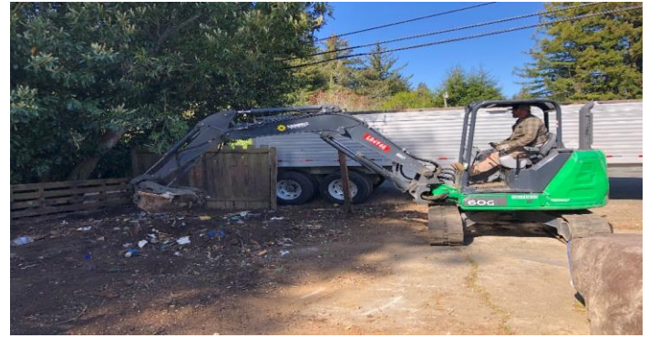
Loading 2nd truck with mini excavator.