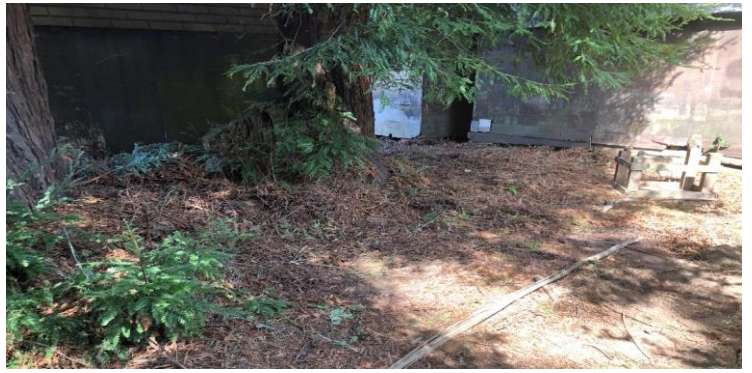
Removed trash under vegetation.