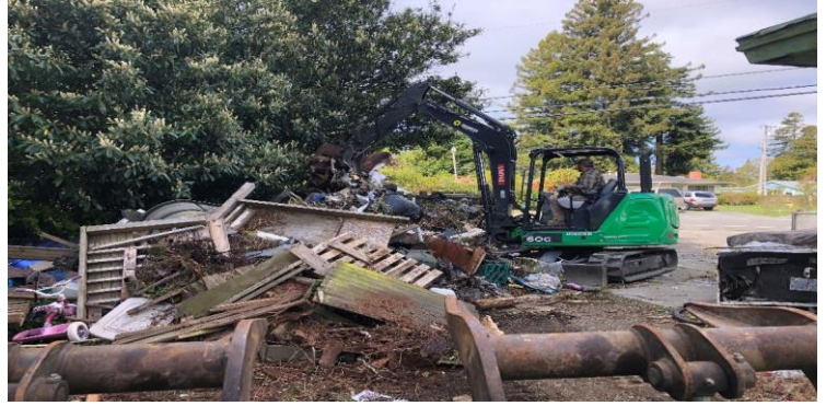
crashing debris with mini excavator and stockpiling with skidsteer.