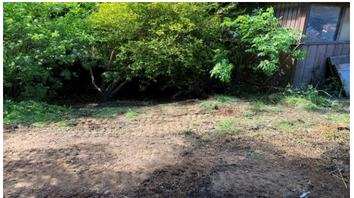
Cleaned left side of yard.