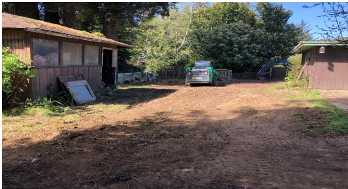
Cleaned left side of yard.