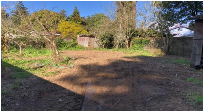
Cleaned top right corner of yard.