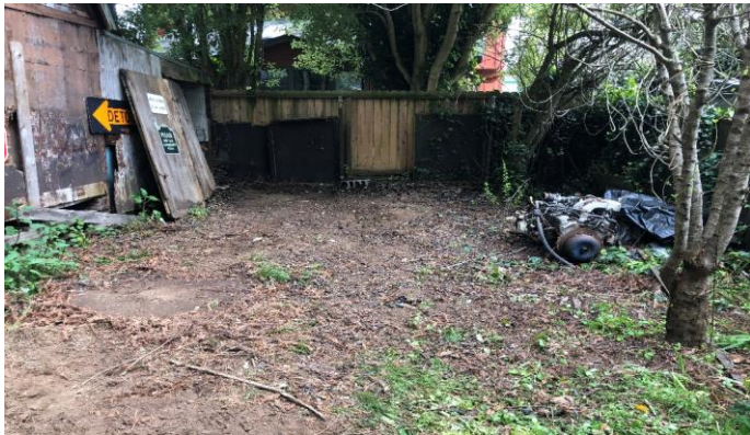
Cleaned up next to shed,waiting for owner to pick up motor.