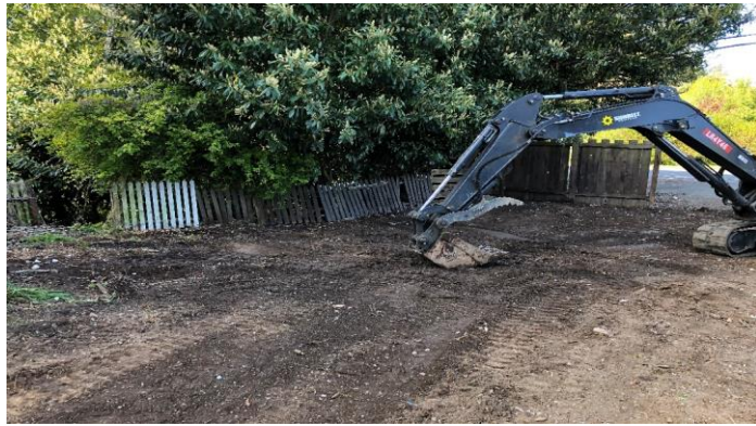
Finished loading trucks and clean area.