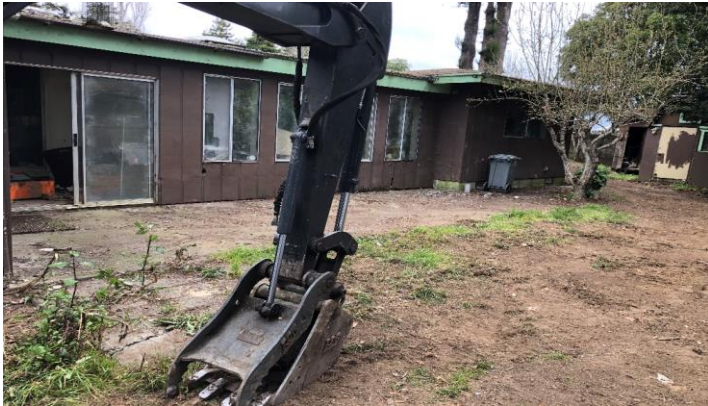
Cleaned up cement pad.