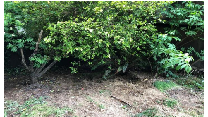
Cleaned up trash cans and pile next to the small trees.