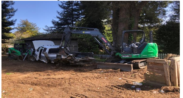
Equipment parked aside.