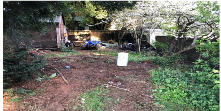
ATV, dirt bikes and motor that owner will pick up next