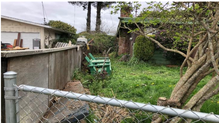
Cleaned up side of front yard.