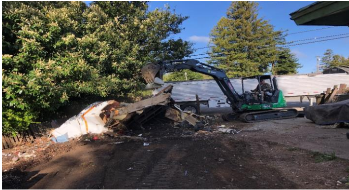
Loading 2nd truck with mini excavator.