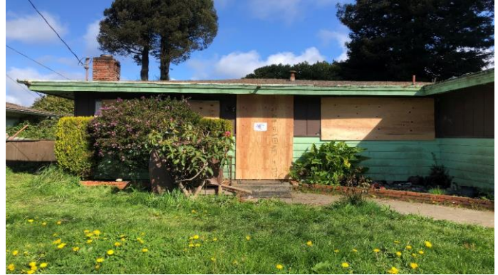
Boarded the front door and windows.