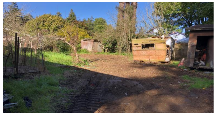
Removed trash and dragged camper out from behind shed.