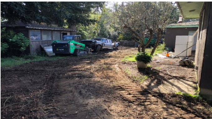
Cleaned side yard and concrete pad.