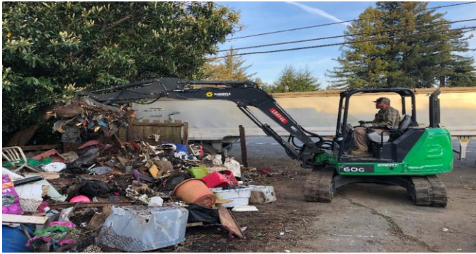
Loading first truck with mini excavator.