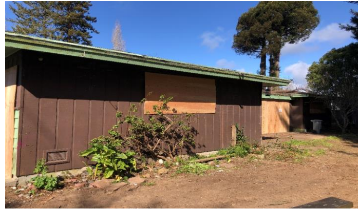
Boarded the window on right side of garage.