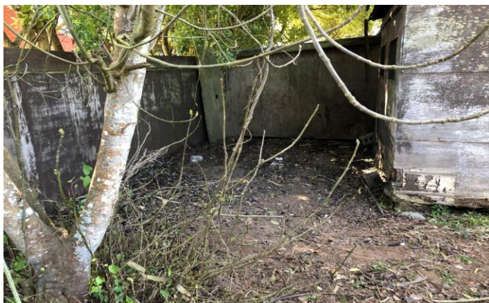
Cleaned top left corner of yard behind shed.