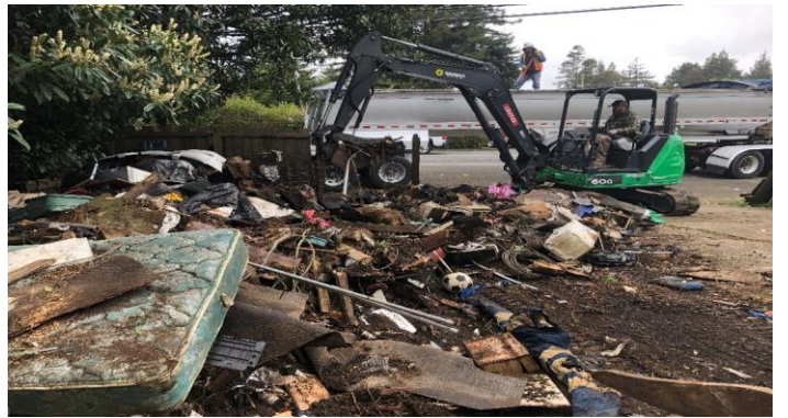
Loading 2nd truck with mini excavator.