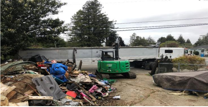
Loading first truck with mini excavator.