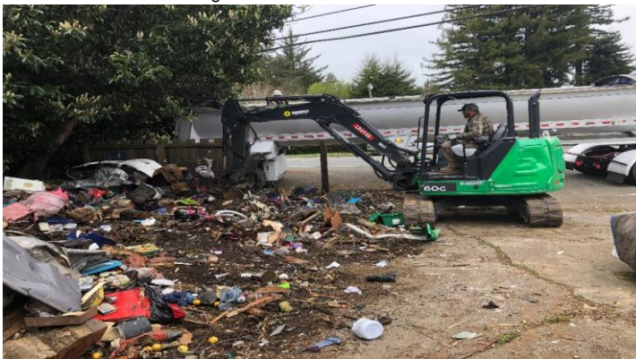
Loading 2nd truck with mini excavator.