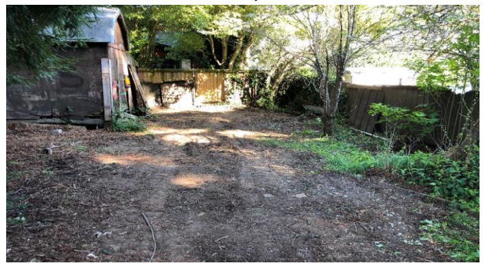
Cleaned top left corner of yard.