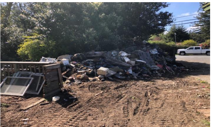
Trash stockpile for load out the next day.