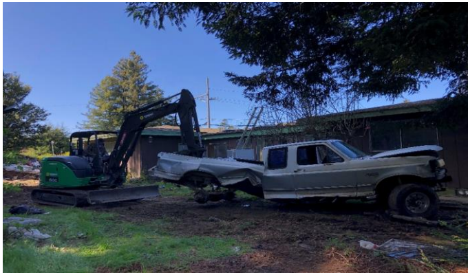
Moved Ford pick up to the side yard for towing.