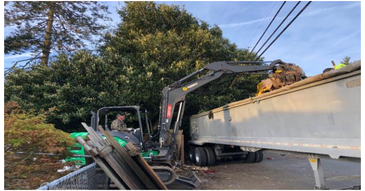
Loading first truck with mini excavator.