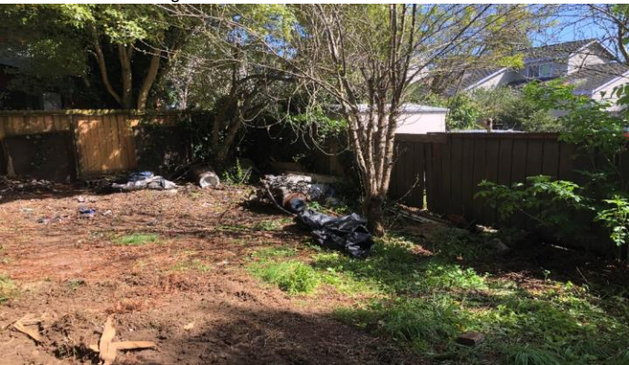
Removed trash from back of property.