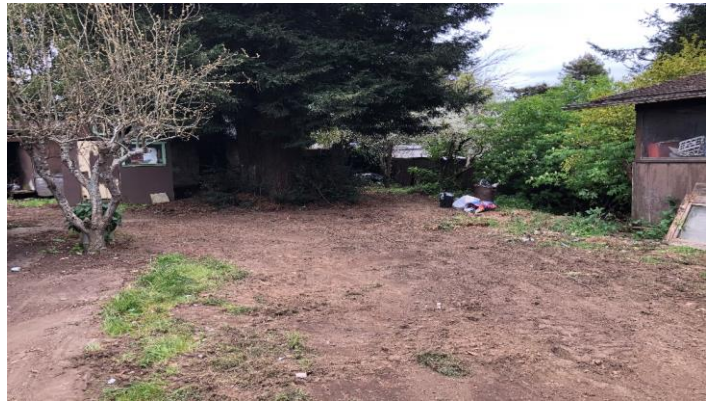
Cleaned up side of back yard.