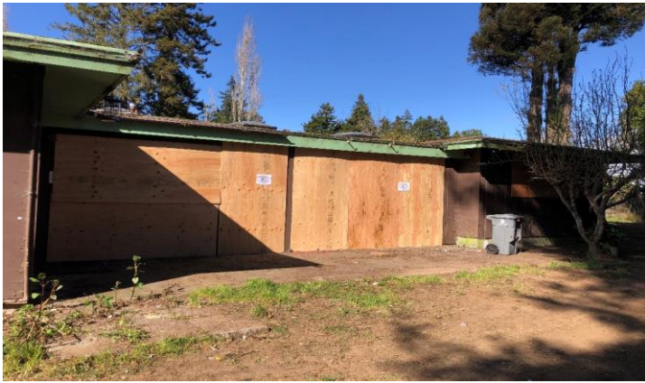
Boarded doors and windows on right side of house.