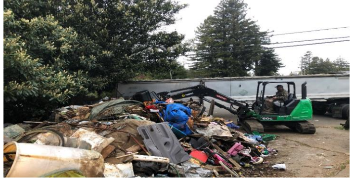
Loading first truck with mini excavator.