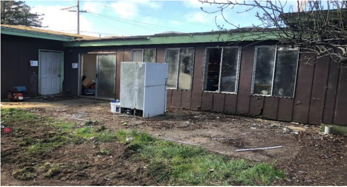
rash and debris removed from sunroom in back yar