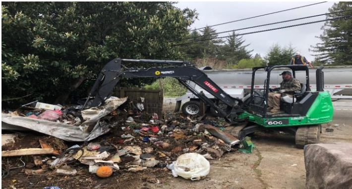
Loading 2nd truck with mini excavator.