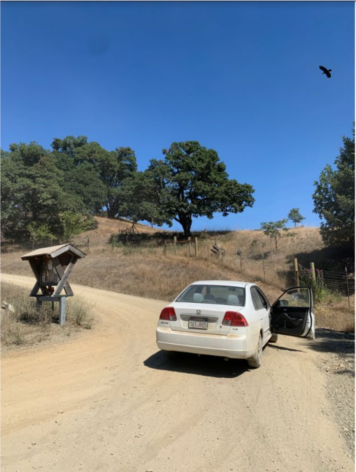
HOGTRAP ROAD X ISLAND MOUNTAIN