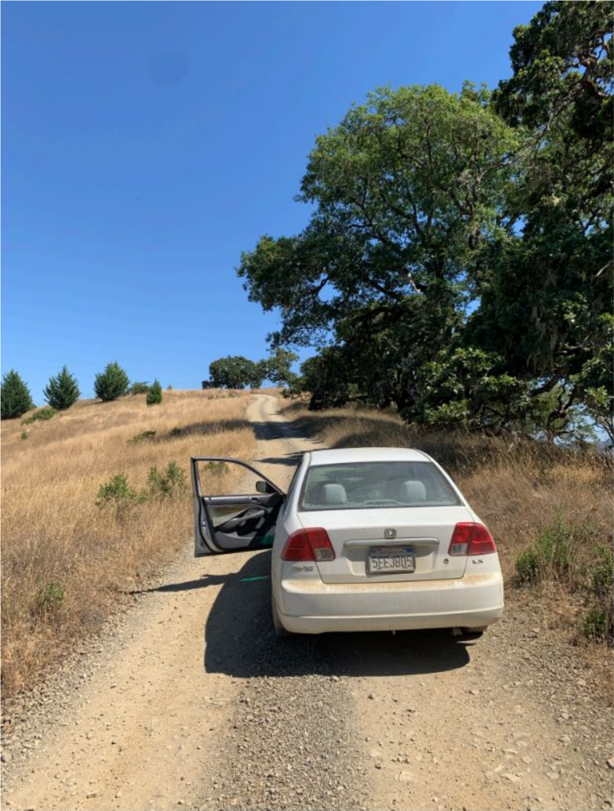
APPROX 0.5 MI DOWN HOGTRAP ROAD