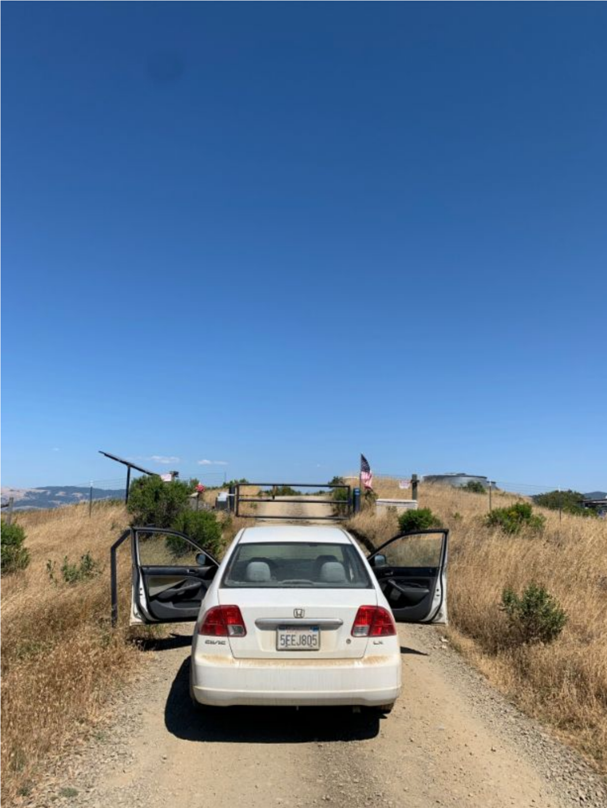
AT PARCEL ENTRY