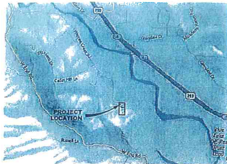
LOCATION MAP SCALE: 1" = 3,000'