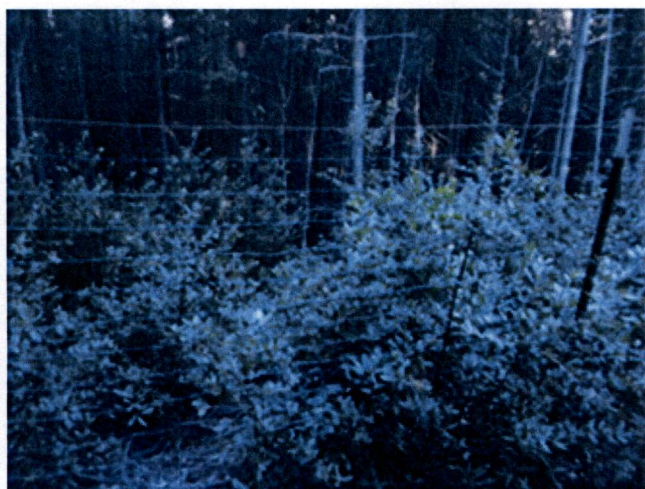
Before FLASH Project

Since 2010, Title III funds were combined with local match from multiple partners to leverage nearly $600,000 from the California Fire Safe Council State Clearinghouse grant program funded by the United States Forest Service (a $300,000 2010 grant and a $195,000 2012 grant). The program is named Fire-adapted Landscapes and Safe Homes (FLASH) and provides incentives to property owners to mitigate wildfire hazards through vegetation management. This is done by awarding a rebate for the creation of defensible space around homes and strategic fuelbreaks along escape routes and high-risk areas. During the life of the FLASH program, hazardous vegetation on over 500 acres of land has been treated to reduce the wildfire risk for homesteads and access routes and a total of 190 landowners completed work on their properties through this program.