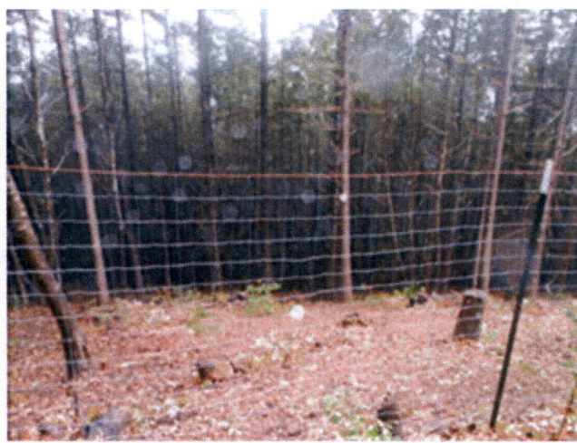
After FLASH Project

In 2014, additional funds to support the continuation of the FLASH program were awarded through the California Fire Safe Council State Clearinghouse in the amount of $200,000. Again, these federal dollars were leveraged using Title III funds and partner match. The goal of the 2014 FLASH Program is to treat approximately 140 acres of hazardous vegetation.