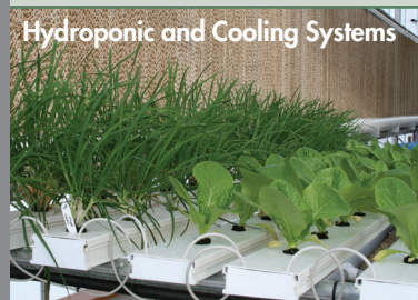
Hydroponic and Cooling Systems