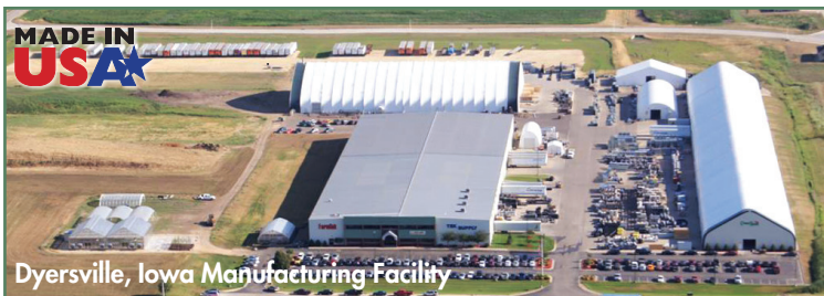
Dyersville, Iowa Manufacturing Facility

Since 1979, Growers Supply has offered cost-effective, versatile and energy-efficient greenhouses and provided the highest-quality products at the most economical prices to the growing and agriculture industry. We provide in-house design, manufacturing and construction, and pride ourselves on offering superior customer service; that's why our experienced greenhouse specialists are highly trained to help you determine the best greenhouse and setup for your needs.