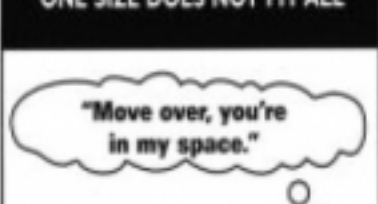
"Move over, you're in my space."

There are few things more adorable than a cute, cuddly puppy. But all puppies grow...and some grow a lot. They also have different exercise, grooming, nutrition, vet care needs. So before you bring one home, make sure you take the time to research the right breed for your lifestyle.