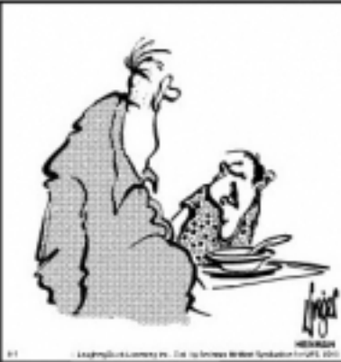
"Dad, which part of the chicken is the noodle?"