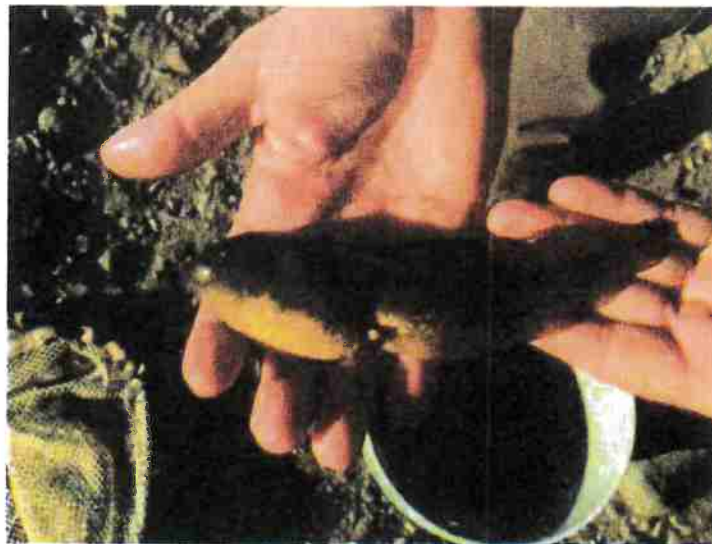
This is a photo of a Bullfrog tadpole.