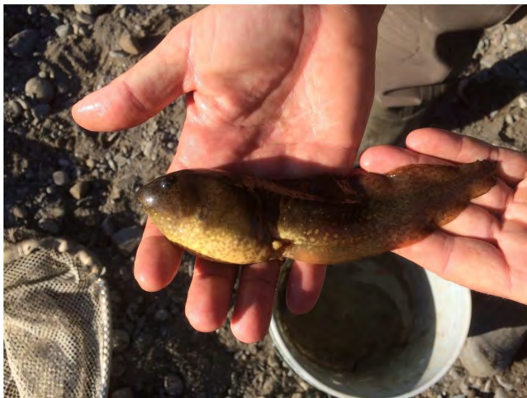
This is a photo of a Bullfrog tadpole.