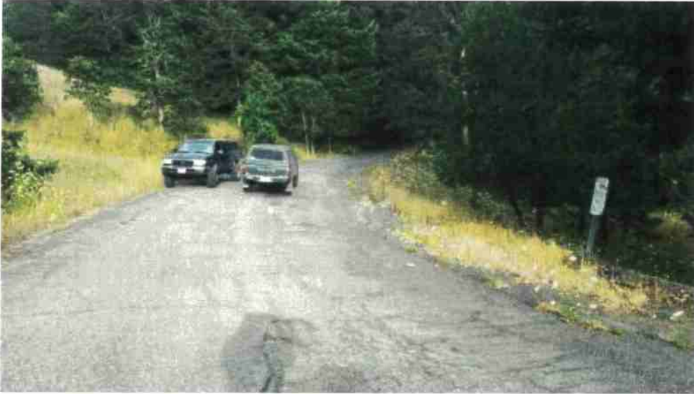
0.5 mi - At parcel entrance for APN 316-086-017