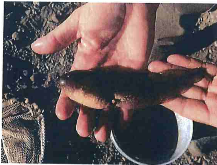
This is a photo of a Bullfrog tadpole.