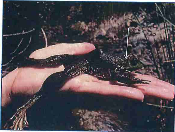
The photos shown in this Appendix demonstrate a medium sized adult bullfrog that was removed from Ten Mile Creek, Mendocino County. Note the bullfrog has a large tympanum, (circular ear drum shown with an arrow) and does not have distinct ridges along its back (dorsolateral folds).