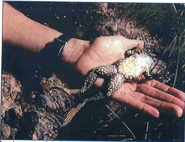
The bullfrog has somewhat distinct mottling and the underside of the bullfrogs hind legs are not shaded pink or red.