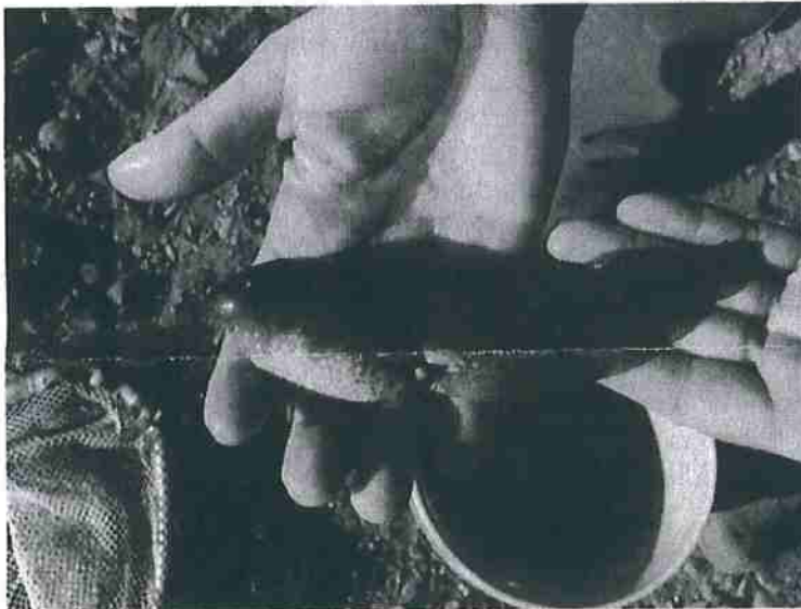
This is a photo of a Bullfrog tadpole.