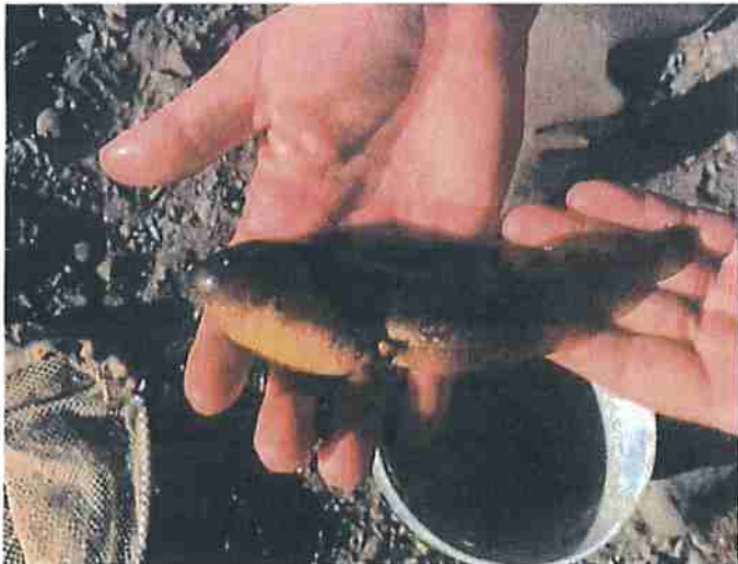
This is a photo of a Bullfrog tadpole.