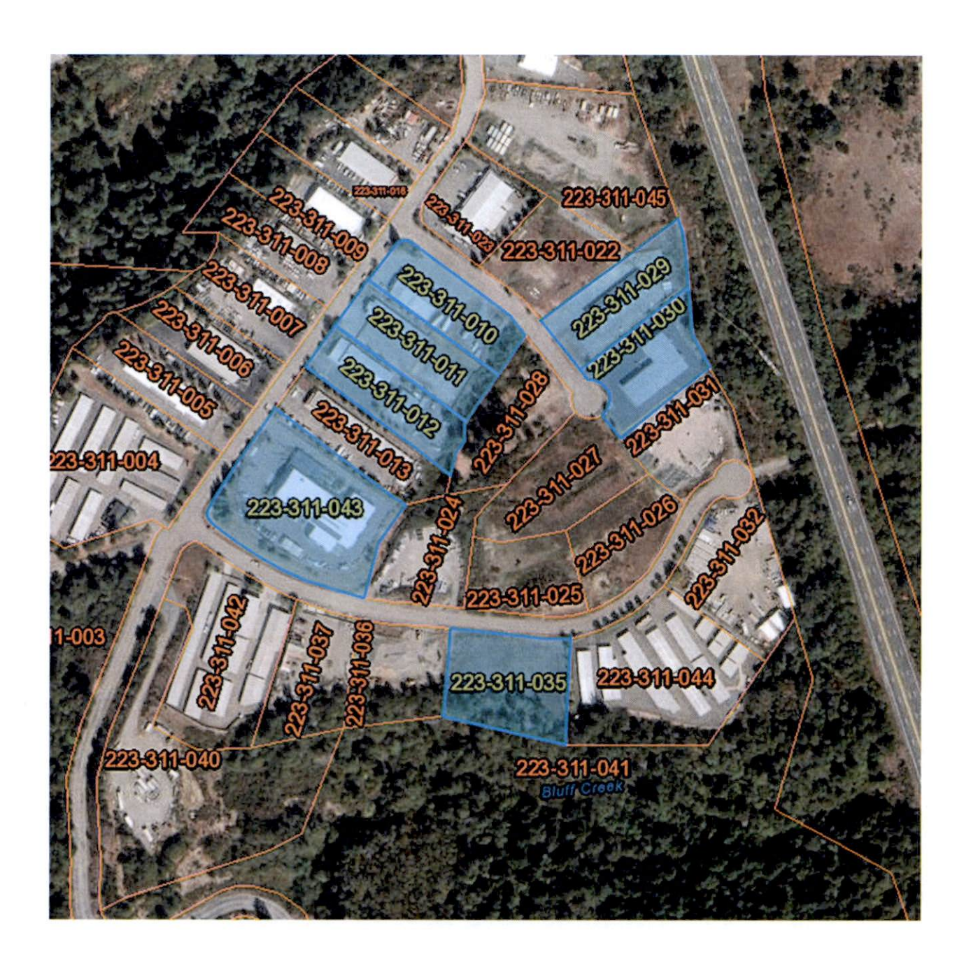
Exhibit B: Legal Description

"Indoor Cultivation Q – Qualified Combining Zone" means and refers to the inland unincorporated area in the County of Humboldt that lies within the exterior boundaries of the reclassification area shown in Exhibit A: Map, of Ordinance No. 275%.