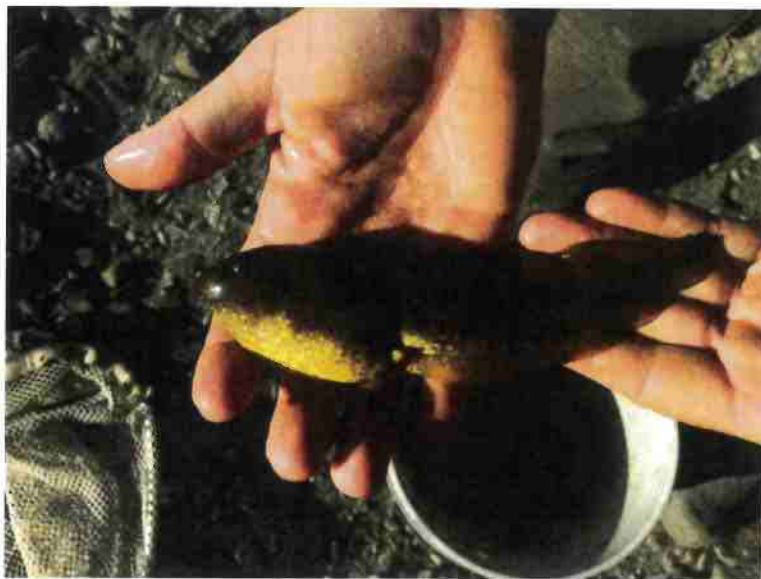
This is a photo of a Bullfrog tadpole.