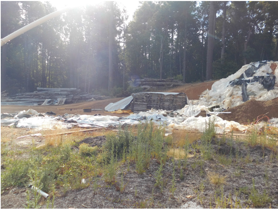
Improper Hazardous Materials Storage