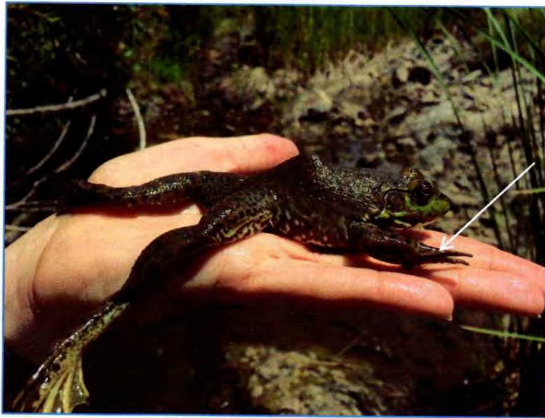
The photos shown in this Appendix demonstrate a medium sized adult bullfrog that was removed from Ten Mile Creek, Mendocino County. Note the bullfrog has a large tympanum, (circular ear drum shown with an arrow) and does not have distinct ridges along its back (dorsolateral folds).