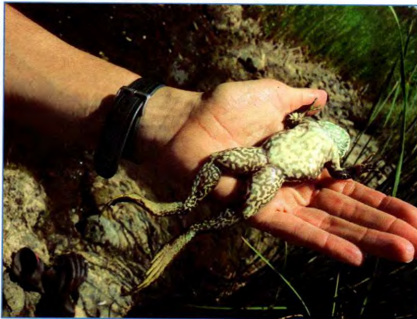
The bullfrog has somewhat distinct mottling and the underside of the bullfrogs hind legs are not shaded pink or red.