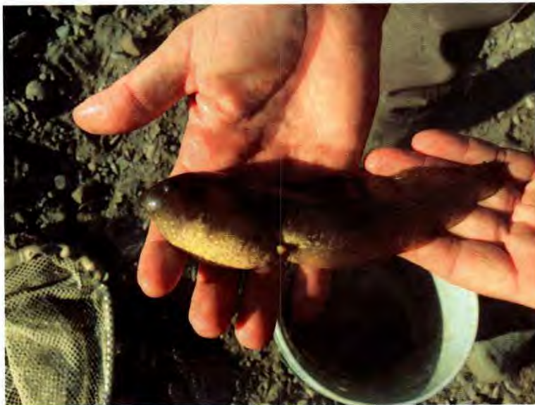
This is a photo of a Bullfrog tadpole. (Photo taken by Mike van Hattem).