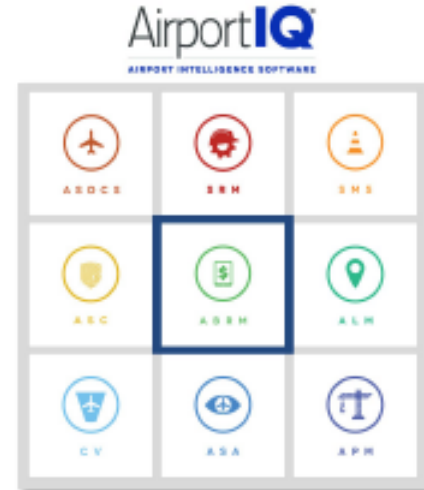
Figure 1: AirportIQ Product Suite

The purpose of this proposal is to respond to the airport’s request for pricing for a lease and property management software solution.