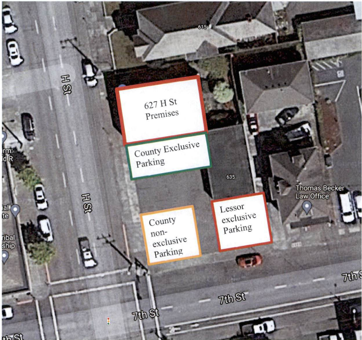
Exhibit A – Premises – Sheet 2 Premises Detail and Parking Lot

Note: Final Parking lot design to be determined.