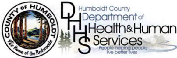
EXHIBIT G CALFRESH OUTREACH QUARTERLY PROJECT REPORT FORM 2-1-1 HUMBOLDT INFORMATION AND RESOURCE CENTER