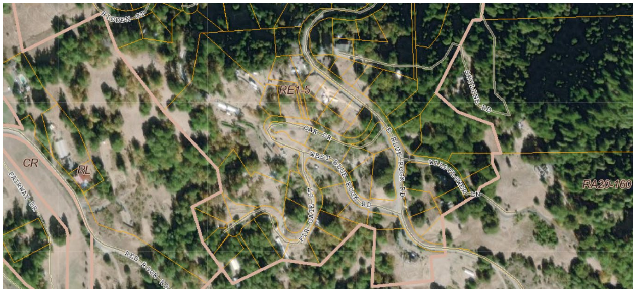
FIGURE 4 - 2019 RHNA HOUSING INVENTORY AND LAND USE DESIGNATIONS