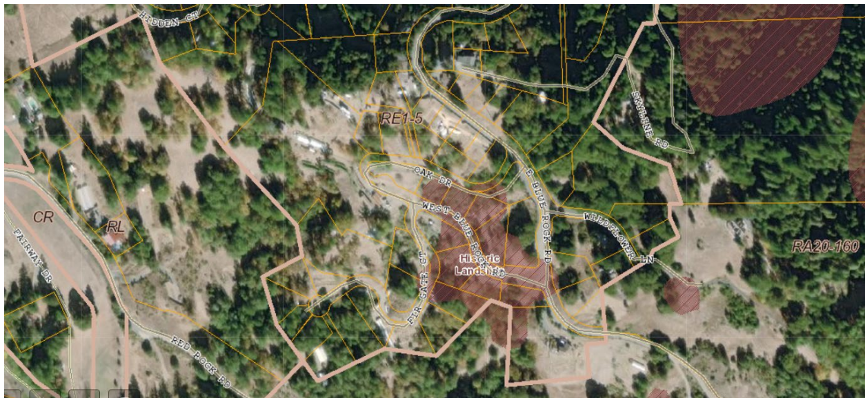
FIGURE 3 - HISTORIC LANDSLIDES AND LAND USE DESIGNATIONS

Project Area contains historic landslide feature