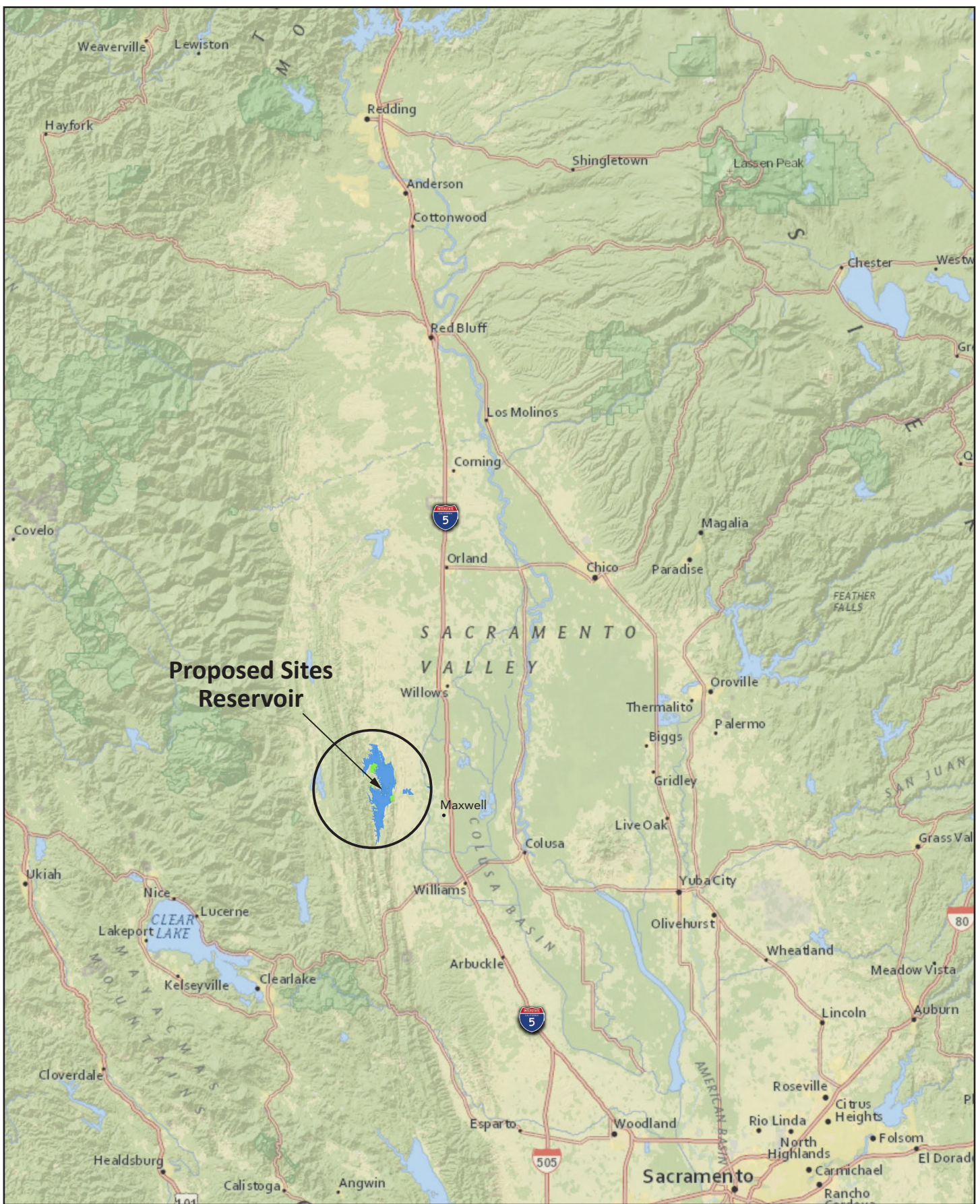
FIGURE 1-1 Proposed Sites Reservoir Project Location