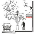
Under Canopy Signs