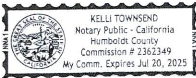
Place Notary Seal and/or Stamp Above

Signature Kelli Townsend Signature of Notary Public