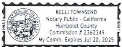
Place Notary Seal and/or Stamp Above

Signature Kelli Townsend Signature of Notary Public