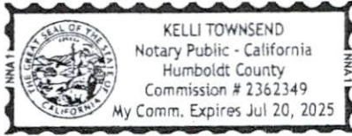
Place Notary Seal and/or Stamp Above

Signature [Handwritten Signature] Signature of Notary Public