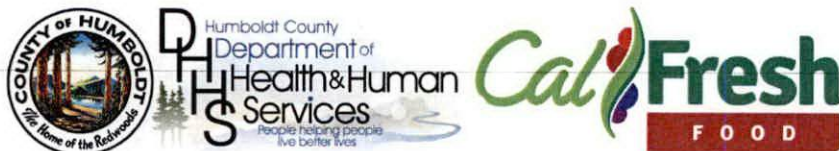
EXHIBIT B CALFRESH OUTREACH PROPOSAL Food for People, Inc. For Fiscal Years 2020-2021 through 2021-2022