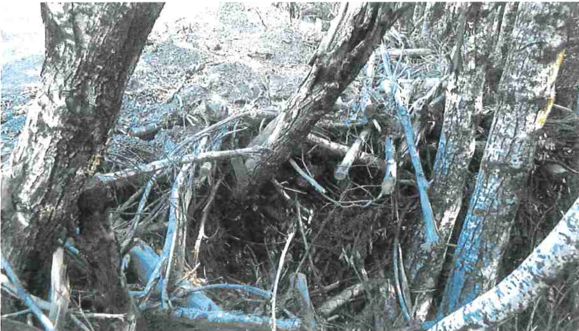
Photograph IMGP0117: View of organic debris buried in fill material.