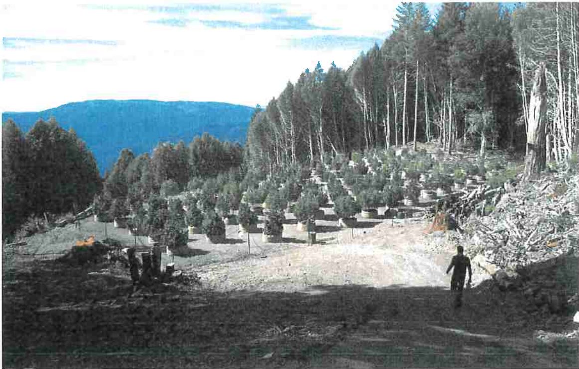
Photograph IMGP0112: Upper slope view of Conversion Area looking west.