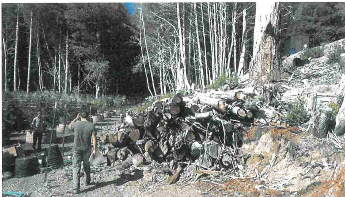
Photograph IMGP0113: View of logs from clearing of trees within Conversion Area.