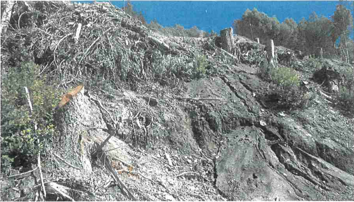
Photograph IMGP0116: View of failing fill material placed on slopes greater than 50%.