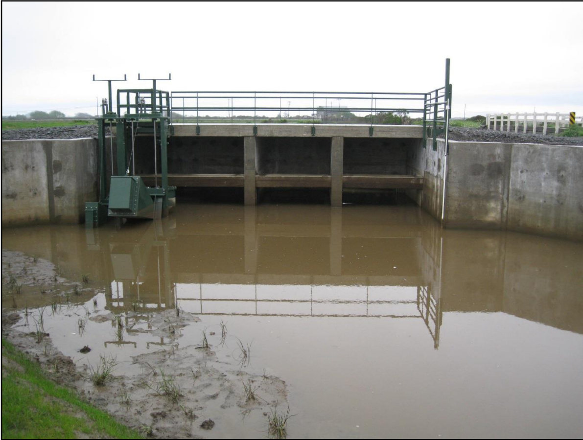
Martin Slough Tide gates, upstream side, showing the two MTR floats at left

After the single 6-foot by 6-foot MTR Gate closes, the auxiliary door will continue to allow a small portion of tidal water to flow into Martin Slough. The auxiliary door is necessary to prolong the duration of upstream fish passage and to create the diversity of tidal elevations necessary to achieve the zonation of salt marsh vegetation that is a project objective. At full build out, once the tide in Martin Slough reaches an elevation of approximately 5.7 feet, an MTR mechanism will close the auxiliary door, preventing saltwater intrusion into Martin Slough above an elevation of 6 feet, to prevent salt burn of the golf course turf and pasture grasses. The interim operation level of the auxiliary door is 5.0 feet, which will allow sufficient tide water to enter Martin Slough to sustain the salt marsh plants that have established along the channel due to the