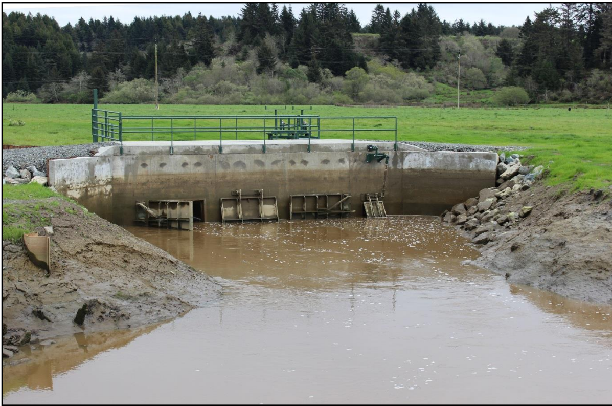
Martin Slough Tide gates, downstream side, showing the three 6' x 6' gates on the center and left and the 2' x 2' "habitat door" on the right.

leakiness of the old tide gates. With the old tide gates, salt marsh plants (mainly Lyngbye's sedge [ Carex lyngbyei ]) established along the channel margins up to the property line between the City of Eureka/ Golf Course property and the NRLT property, and through the old meander in the pasture except for the area from Station M 9+00 to M 15+00 which receives enough freshwater spring flow to keep that section of the meander fresh (see Sheet C-103).