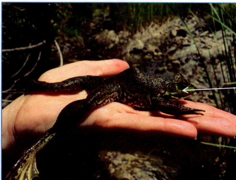
The photos shown in this Appendix demonstrate a medium sized adult bullfrog that was removed from Ten Mile Creek, Mendocino County. Note the bullfrog has a large tympanum, (circular ear drum shown with an arrow) and does not have distinct ridges along its back (dorsolateral folds).