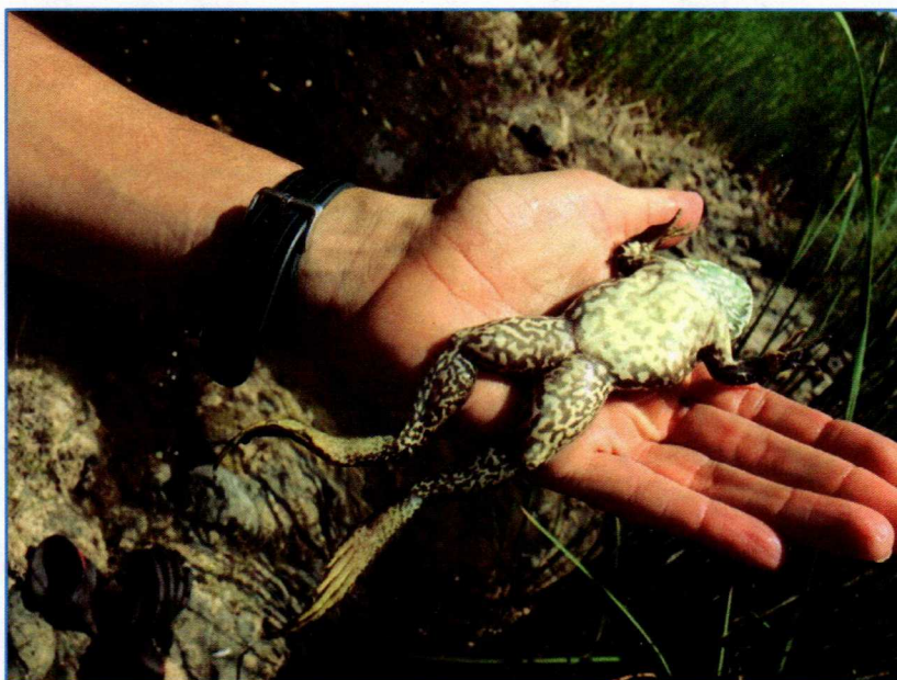
The bullfrog has somewhat distinct mottling and the underside of the bullfrog's hind legs are not shaded pink or red.