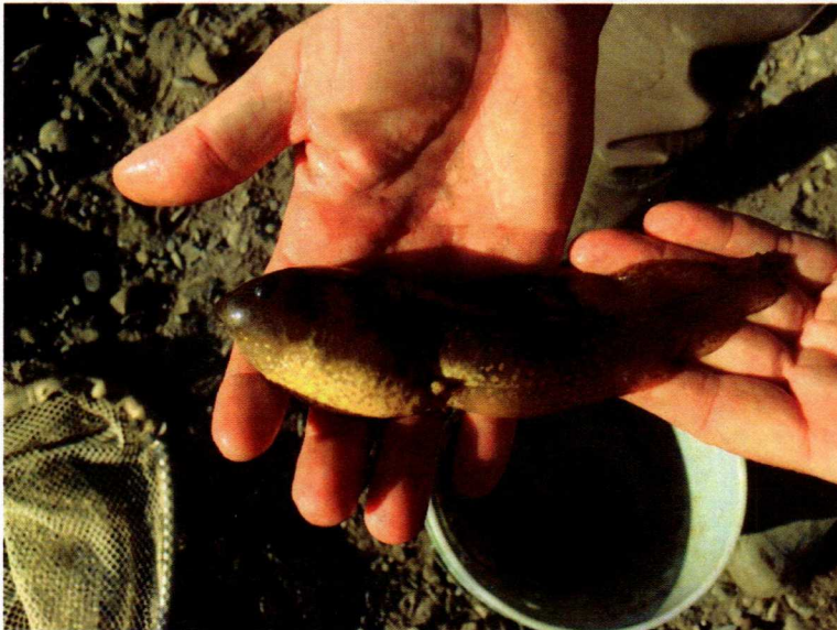
This is a photo of a Bullfrog tadpole.