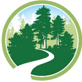
EXHIBIT E Project Evaluation Form- Final Report